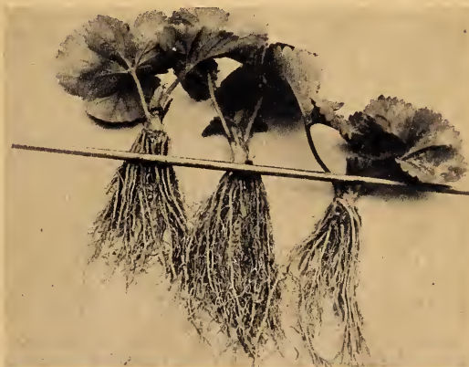
TOO SHALLOW JUST RIGHT TOO DEEP

WHAT IS THE BEST METHOD OF SETTING PLANTS? Any method is good which leaves the roots reasonably straight down in the soil, spread some if possible, with the soil pressed firmly against the roots and the bud just at the surface of the packed down soil. A good garden trowel is the best tool for the work in small plots. Others are a spade, dibble, paddle, a big spoon or in larger fields a horse or tractor drawn transplanter. With plants that have very long roots clipping them off to about 4 or 5 inches in length will make it easier to get a good job of setting. It will not hurt the plants. No matter how long or how short the leaf stems, fruit stems or roots may be at time of setting, the bud must be just at the surface. (See picture.)