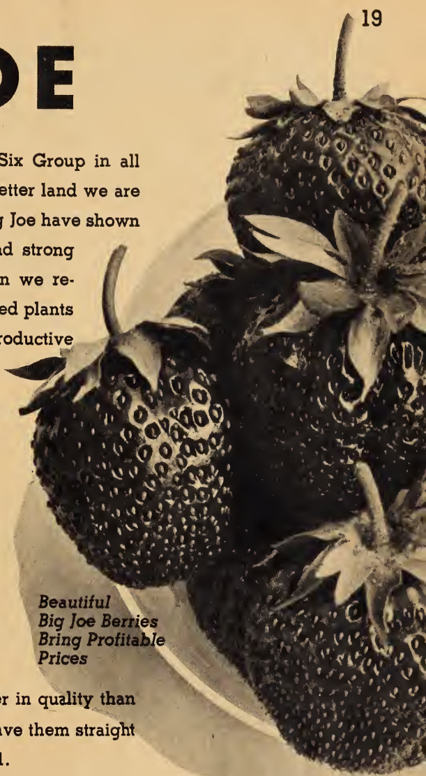
Beautiful Big Joe Berries Bring Profitable Prices

Big Joe is not as hardy as Premier and Catskill. Frosty sites should be avoided especially if planted in northern states. Locally Big Joe is badly mixed with Lupton and in growers fields, Big Joe often being called improved Lupton. Big Joe berries are far better in quality than Lupton and deserve to be kept straight. We have them straight and the plants are beautiful. Price list, page 31.