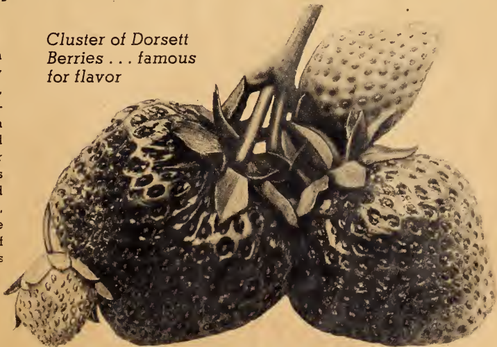
Cluster of Dorsett Berries . . . famous for flavor

A fine old variety that has been grown in the Middle and Northern states for many years. It is an extremely vigorous grower, making lots of plants, which are very productive. Berries are medium in size, a bright rich red clear through, and of good quality. One of the best for canning or freezing. The hardiness of Dunlap plants makes the variety a favorite where the cold winters injure weaker kinds. Canada, Maine, Iowa, Minnesota are among the places where Dunlap is appreciated. Of this variety we have a very fine vigorous stock, the best in years." Here's the place to get your Dunlap plants. Price list, page 31.