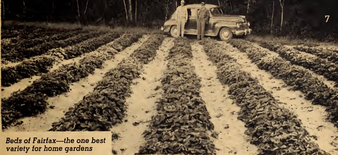
Beds of Fairfax—the one best variety for home gardens