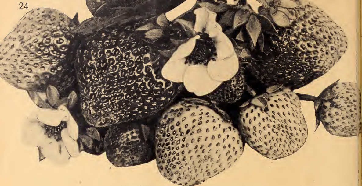
Mastodon—most dependable everbearer.