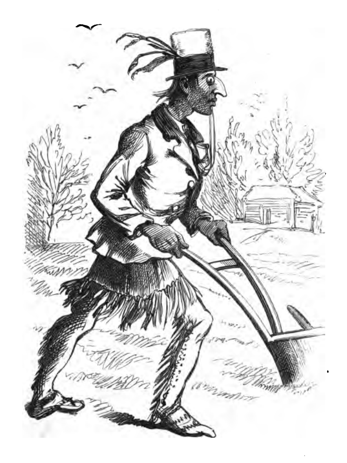
The Otoe Indian buries his tomahawk, and settles down to farming.