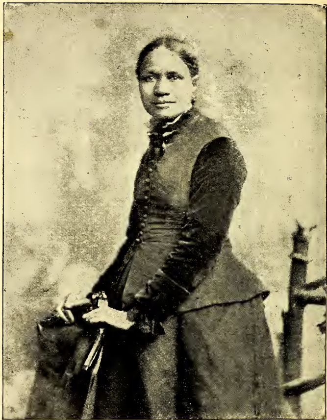
Frances C. W. Harper.