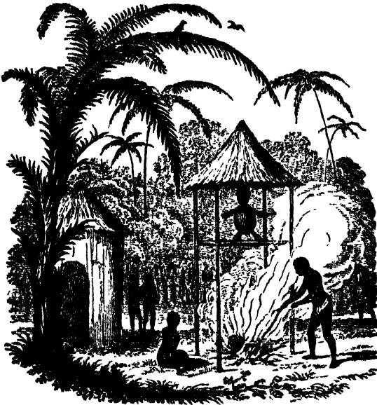
Fetish Deity of Damuggoo.

A feast and great rejoicings are to take place to-day; in consequence of our arrival, and the preparation of the bullock only seems to be the first step towards it. The natives are getting their muskets ready, and all the swivels in the town are brought and placed under the fetish tree we have mentioned.