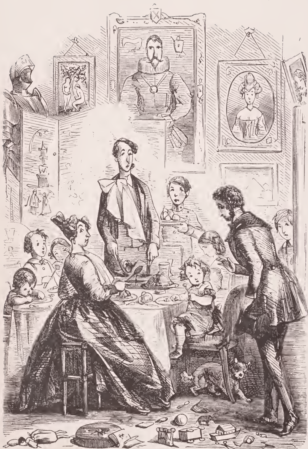
PELHAM'S VISIT TO THE BREAKFAST-TABLE OF THE REV. COMBER-MERE ST. QUINTIN.