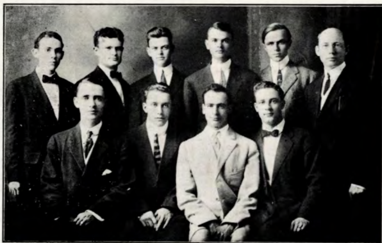
The Phi Alpha Fraternity.

Thus ended the twenty-seventh year, and began the twenty-eighth, of Rollins College, the oldest institution of higher learning in Florida, the mother of many good men and women, esteemed and beloved by multitudes of friends.