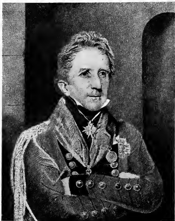
SIR HUDSON LOWE

(From a Pencil Drawing in possession of his Daughter)