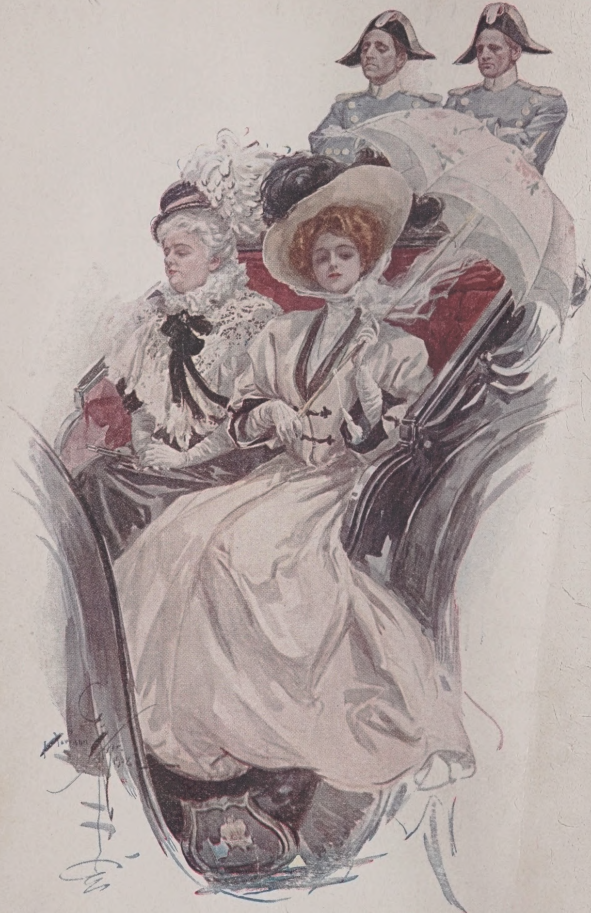
“He saw the Princess for the first time that afternoon” (p. 25)