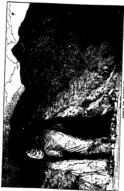
1 IDOLS OF BAMEAN.