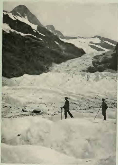
The Glacier from below the Schwarzegg Hut looking towards the Strallegg and Schreckhorn