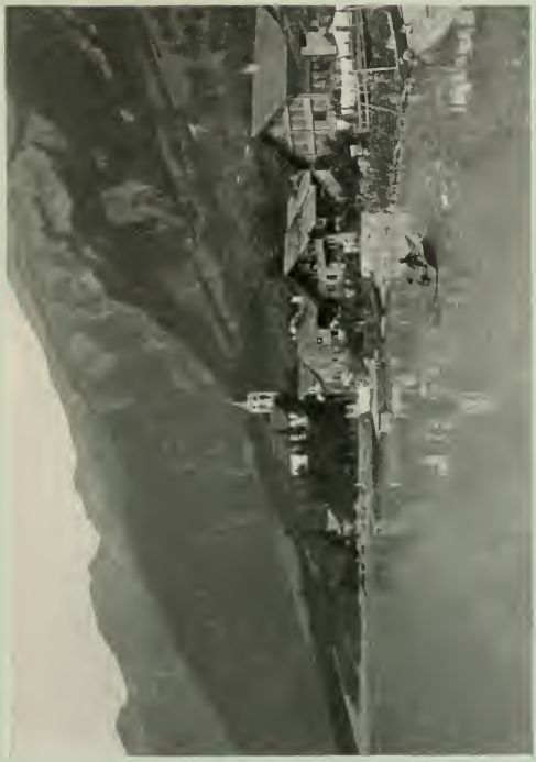
Breiz Village and Lake