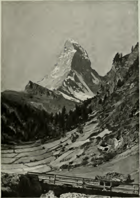
The Matterhorn from the outskirts of Zermatt