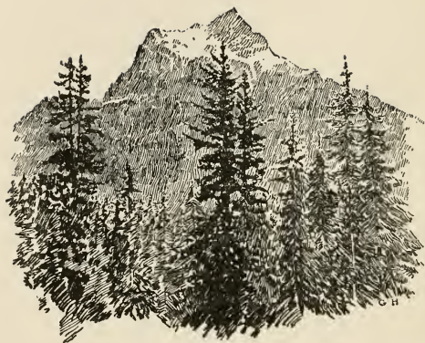
THE WETTERHORN SEEN THROUGH THE TREES FROM THE FAULHORN PATH