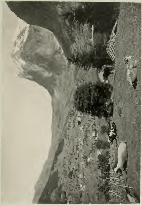
Grindelwald Valley and Wetterhorn