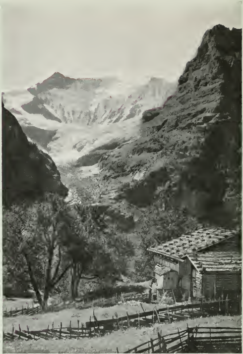
Grindelwald Lower Glacier