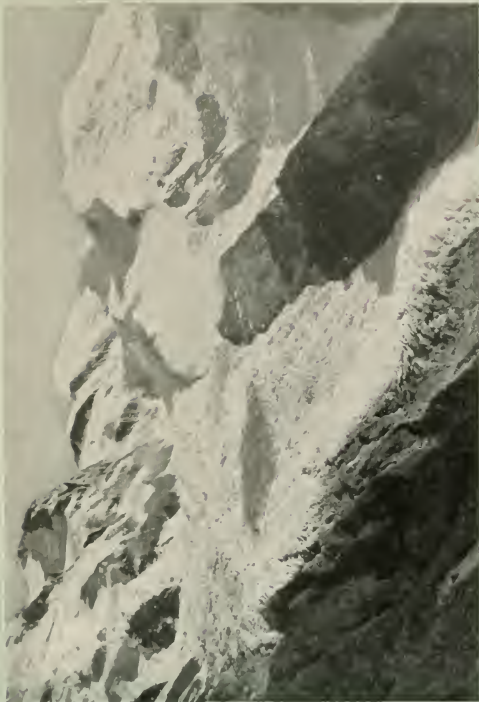
Mont Blanc, Glacier des Bossous