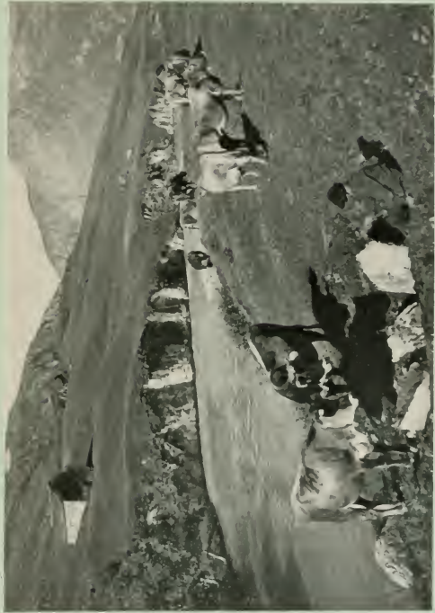
The Banks of the Reuss, Saint Gothard Pass