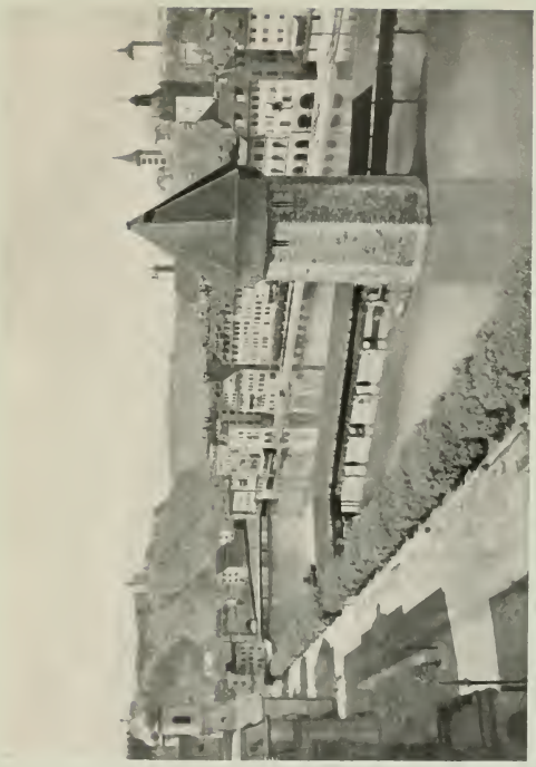
Lucerne, Old Covered Bridge and Water Tower