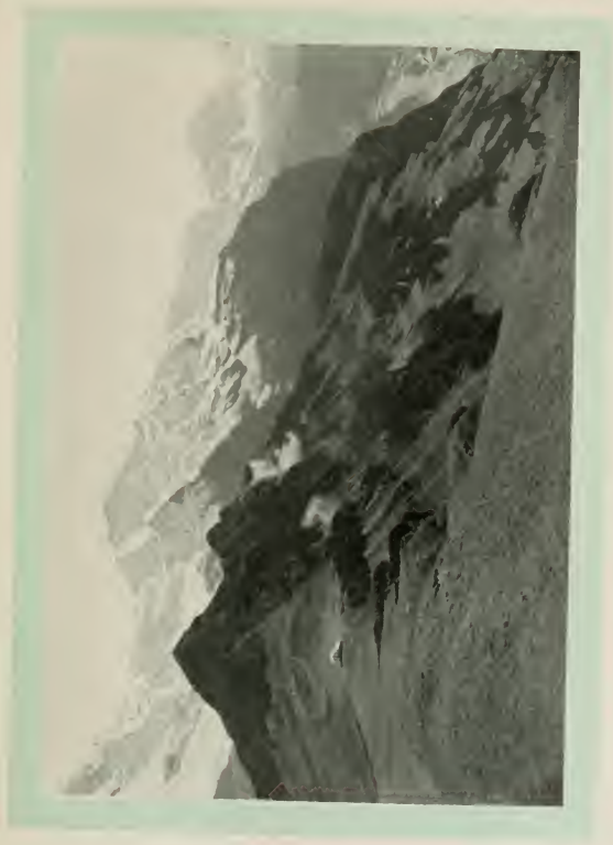
Mönch and Jungfrau from the Männlichen