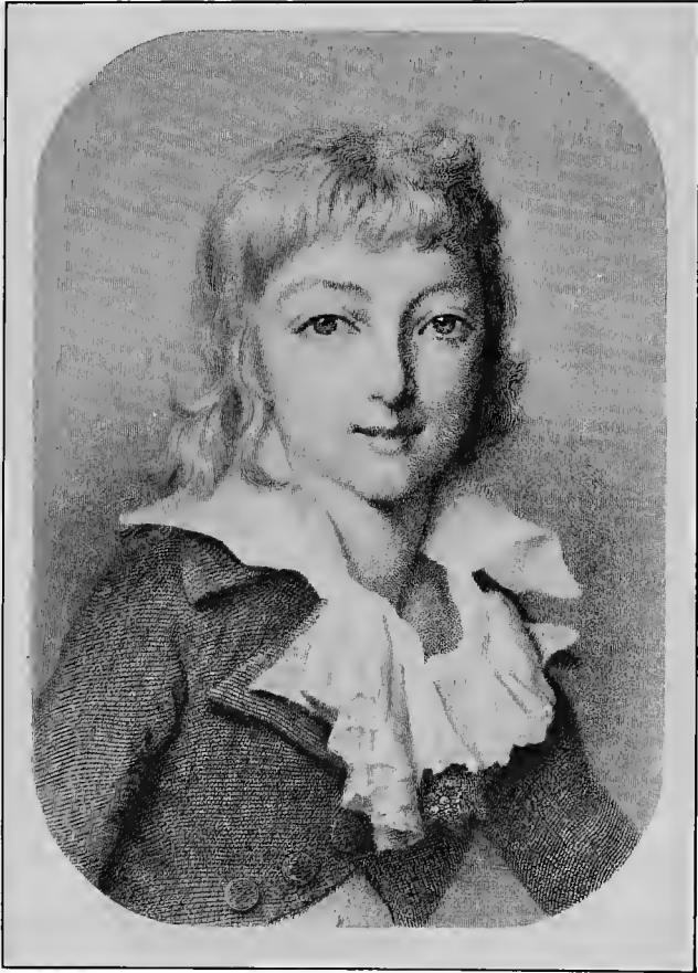
Regnault Engraver, after a miniature by Dumont.