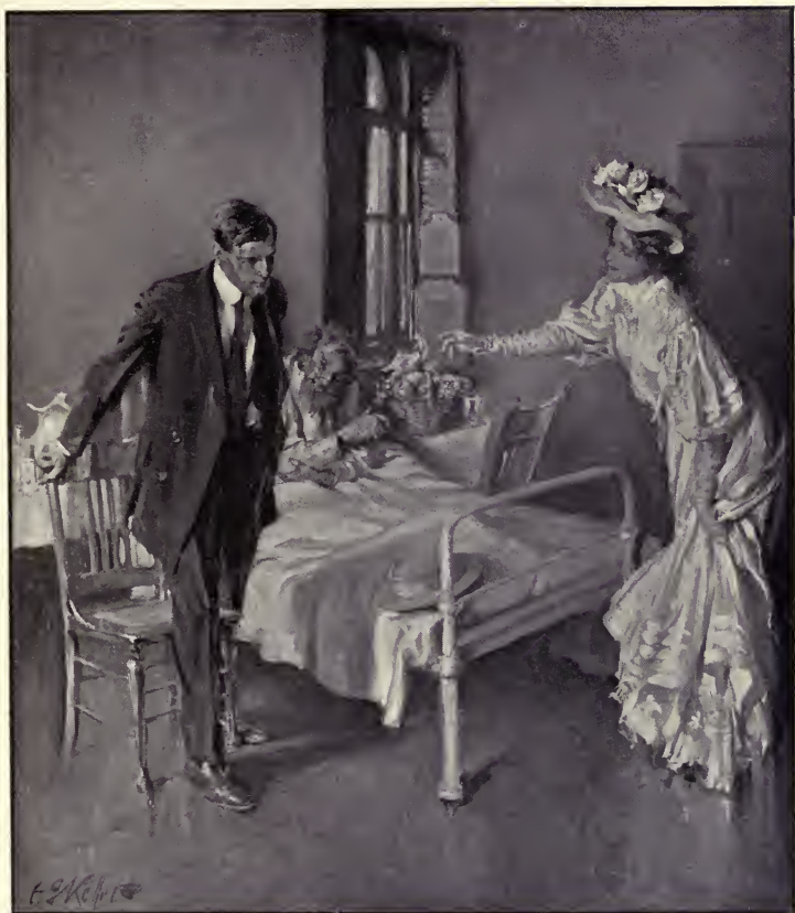
SHE RAISED HER HEAD AND LOOKED AT AUSTEN IN A CURIOUS, INSCRUTABLE WAY.