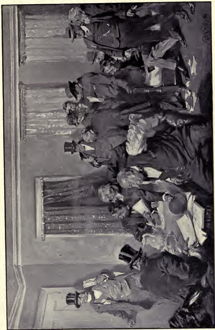
“I THOUGHT I’D DROP IN TO SHAKE HANDS WITH YOU.”