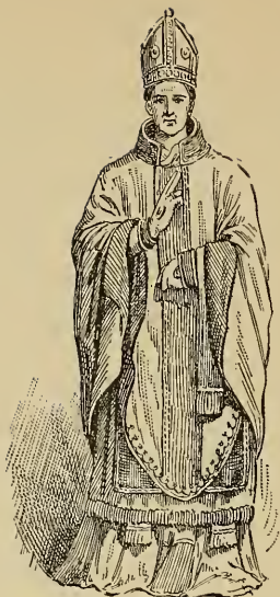
WILLIAM OF COLCHESTER