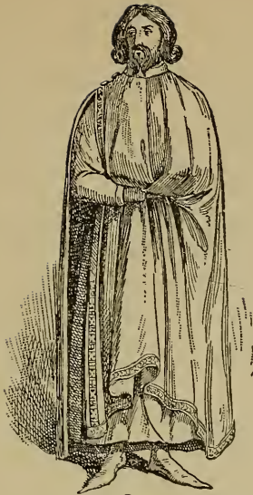
EDMUND OF LANGLEY