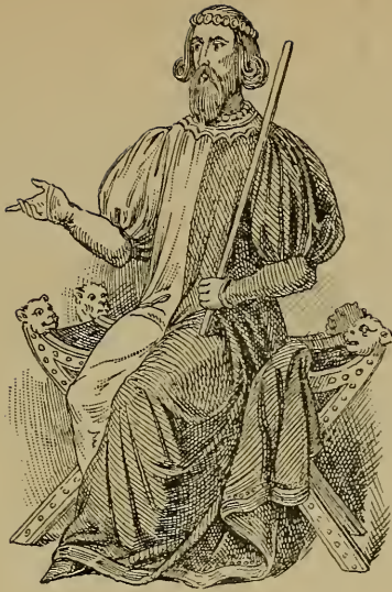
JOHN OF GAUNT