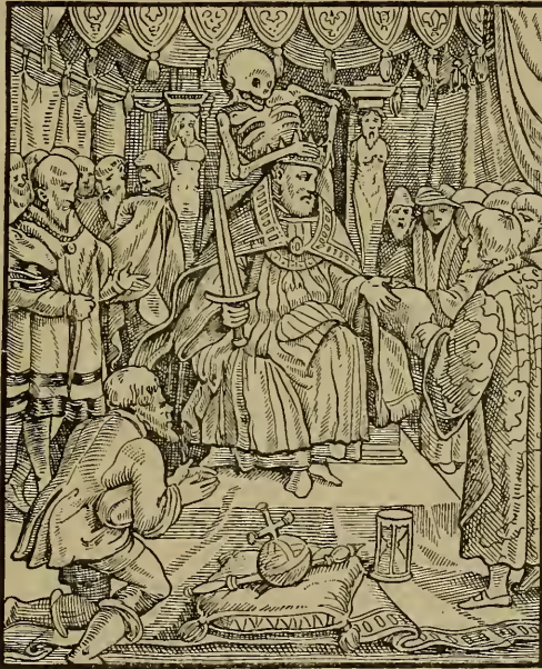
"THERE THE ANTIC SITS"

153. Model. Johnson says: "He uses model for mould ; that earth, which, closing upon the body, takes its form." Malone explains it in a similar way. According to Douce, the word here "seems to mean a measure, portion, or quantity."