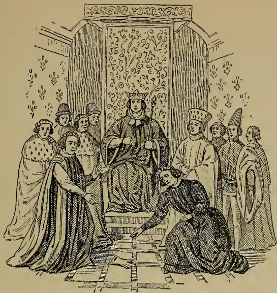
THROWING THE GAGE