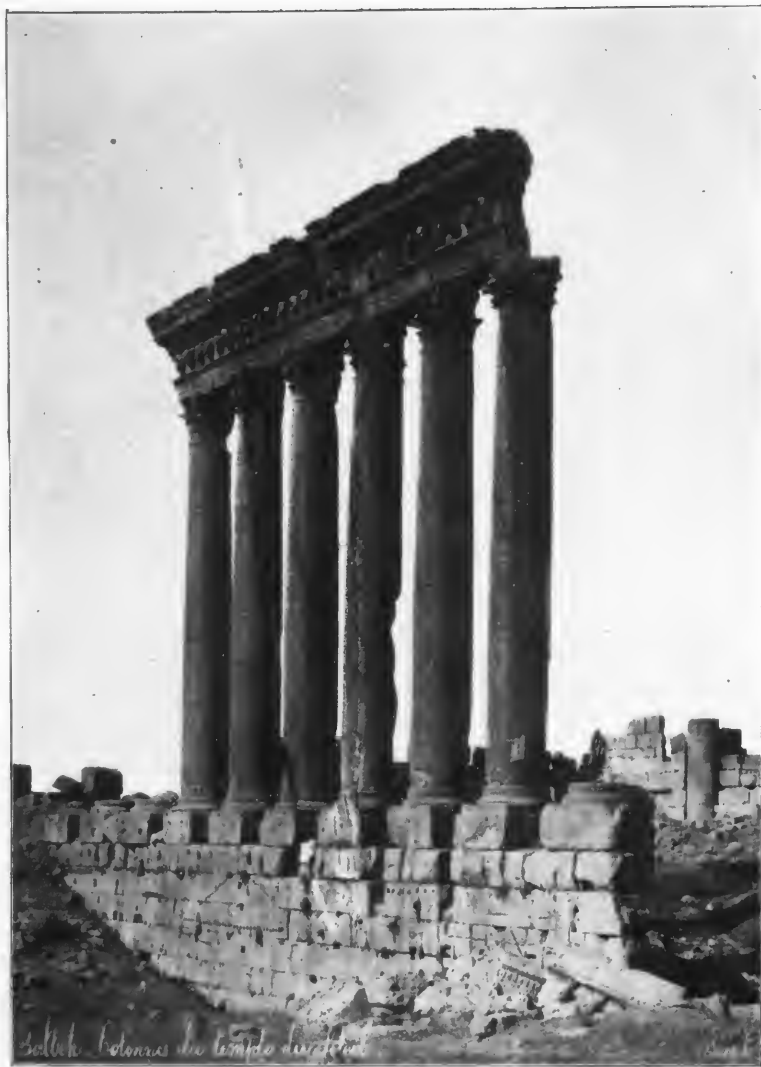
COLUMNS OF THE SUN-TEMPLE AT BAALBEK.