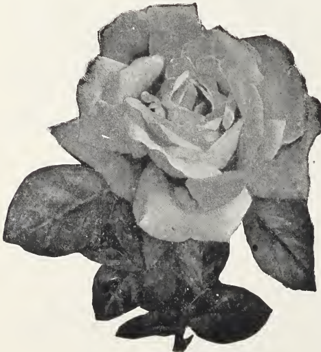
FRAU KARL DRUSCHKI

Baby Rambler, a dwarf; color red, blooms all summer—30c each; $2.50 for 10.