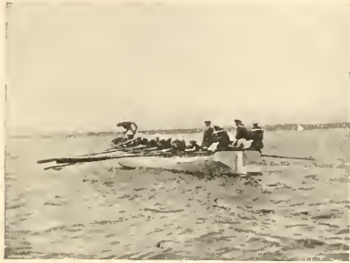
BOAT CREW AT CHARLES ISLAND

To extend its activities the division sent a picked gun