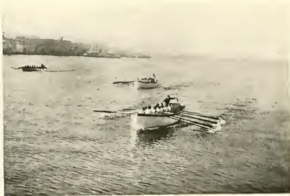
DIVISION BOAT RACE IN BOSTON HARBOR

From Niantic the division went to the receiving ship Minnesota at the Congress Street slip in the Charlestown