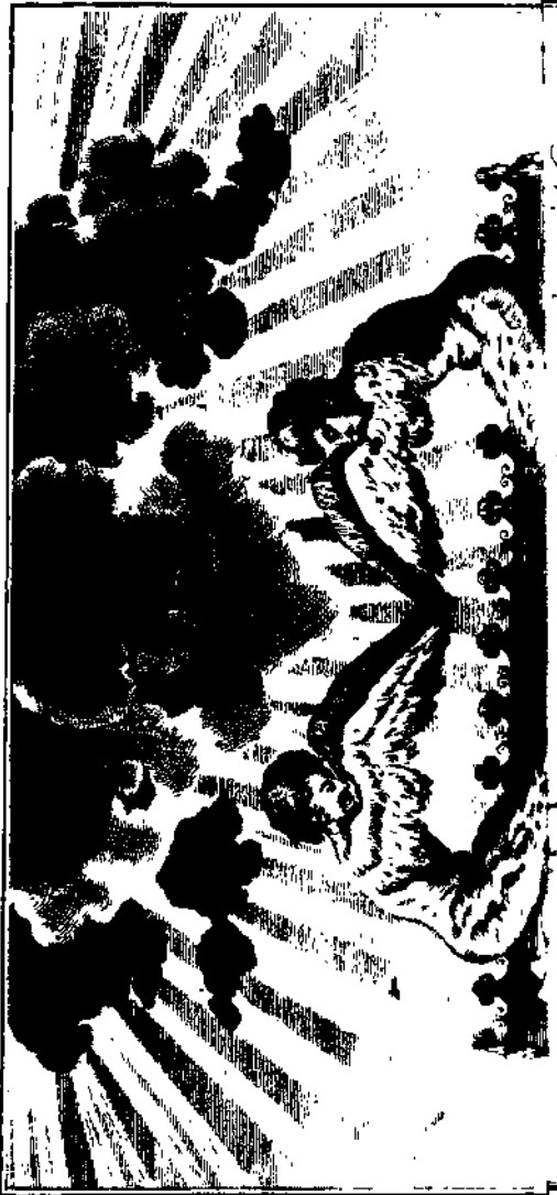
ZETE OMBPIOΣ, see JUPITER PLEVIUS; offered , by STRABO, to one of the Deities adored by the Indians by which he used to be worshipped the HINDOO GOD of the FIRMAMENT, descending in torrents during the annual rains . From Mountfaucon.