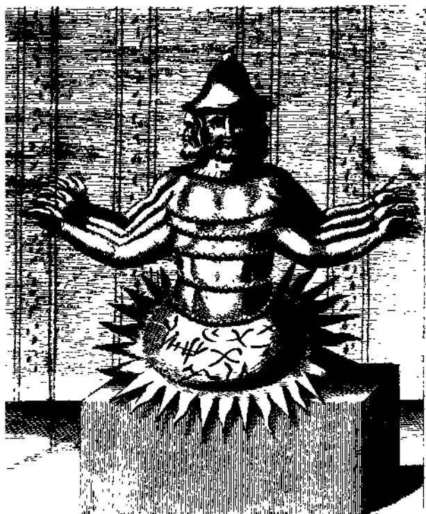
NUMEN TRIPLEX JAPONICUM.