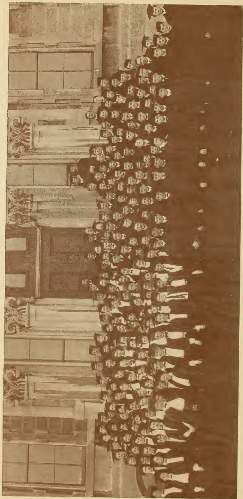
THE CLASS OF 1904 OF SYRACUSE UNIVERSITY