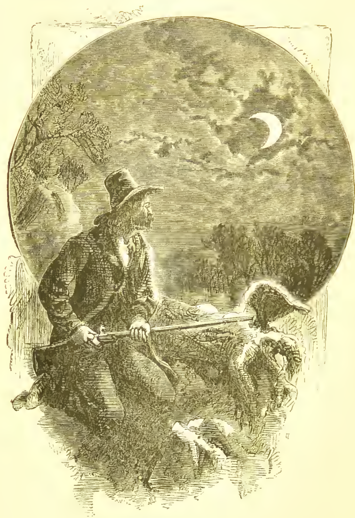
Far North—Page 111.