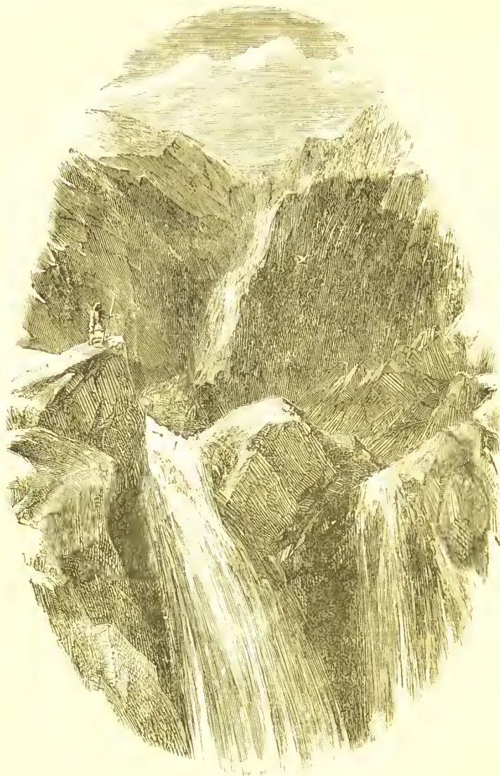
Far North—Page 127.