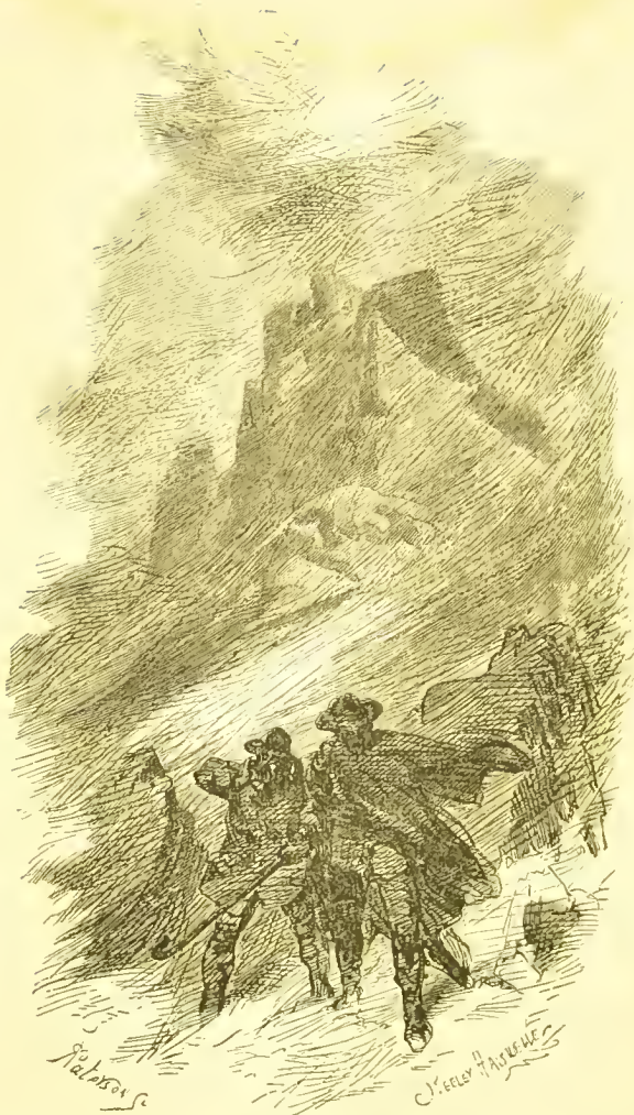
Far North—Page 35.