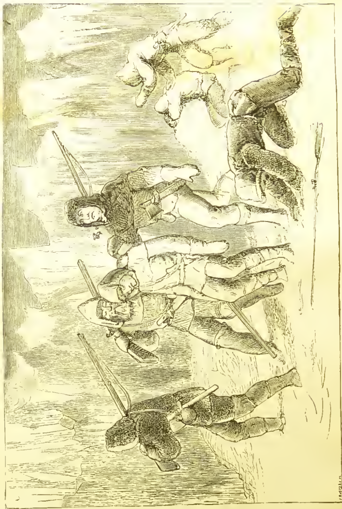
THE FAR NORTH. — Page 67. (Frontispiece.)