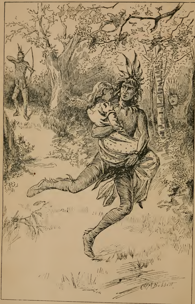
"HE TURNED JUST IN TIME TO ESCAPE AN ARROW."