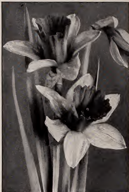
Glory of Leiden