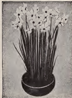
Poet's Narcissi growing in Fiber