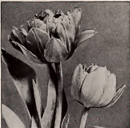
Double Early Tulips