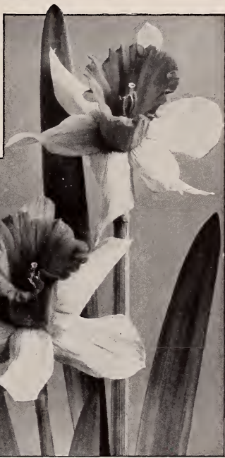
Madame Plemp Daffodil