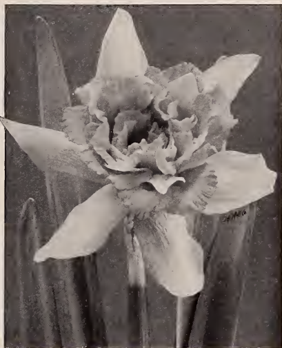
Double Narcissus, Von Sion