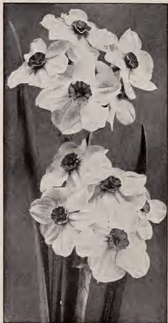
Poetaz Narcissi, Elvira

Grand Soleil d'Or. Early and showy golden perianth, brilliant orange-cup..... 04 40 3 00