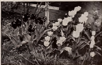
Bed of Single Tulips