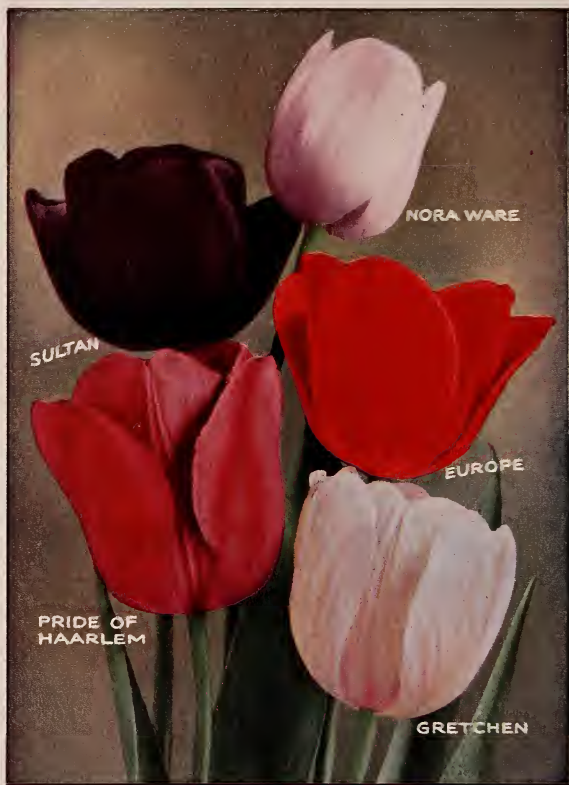
BECKERT'S GIANT DARWIN TULIPS