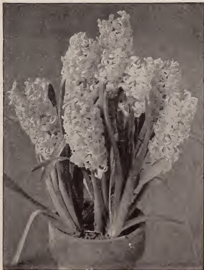
A pot of Single Hyacinths

Monsieur Van der Hoop. A pure white sport of Madame Van der Hoop, but with a larger truss; splendid for pots.