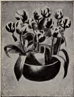
Tulips growing in Fiber