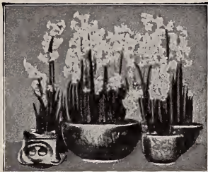
Roman Hyacinths growing in Fiber