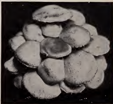
Pure-Culture Mushroom Spawna