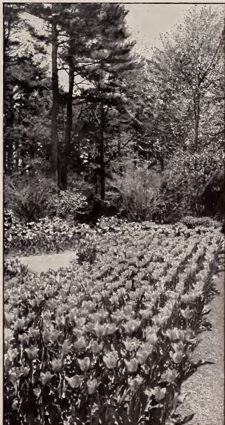
Bed of Single Tulips