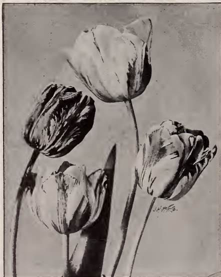
Single Early Tulips