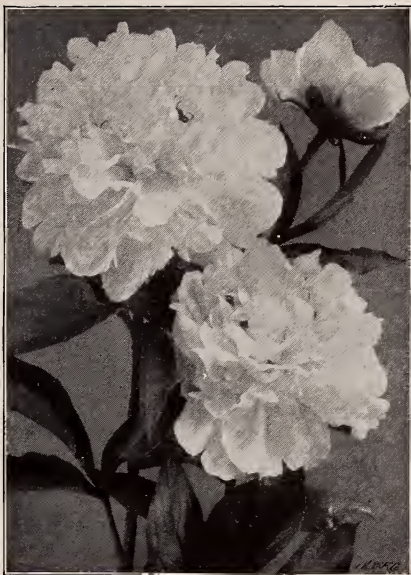
Peony, Festiva Maxima