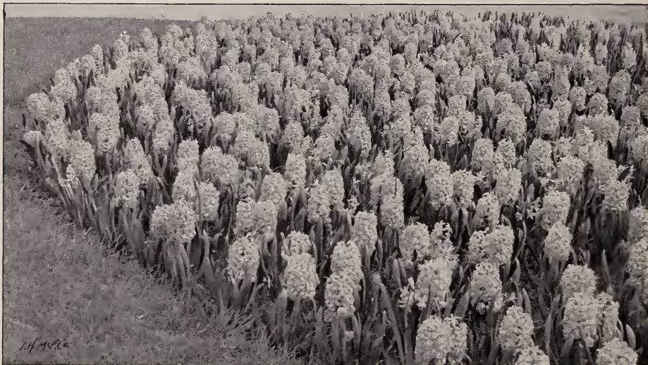
Bed of Hyacinths