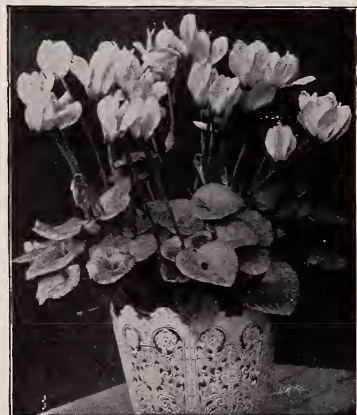
Cyclamen Persicum giganteum

Aethiopica (Lily of the Nile). The old favorite Calla Lily. Mammoth bulbs, 3 in. diam., and up, 25 cts. each, $2.50 per doz., $2.75 per doz. postpaid, $18 per 100.