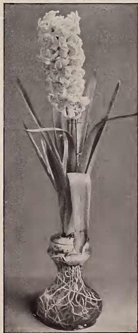
Hyacinth in glass

By parcel post, add for postage at your zone rate—on ½pk. for 3 lbs., pk. 5 lbs., bus. 18 lbs.