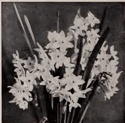
Paper-White Grandiflora Narcissi

Poeticus (Pheasant's Eye). Pure white perianth, cup edged saffron .....$6 per 1,000. 12 90