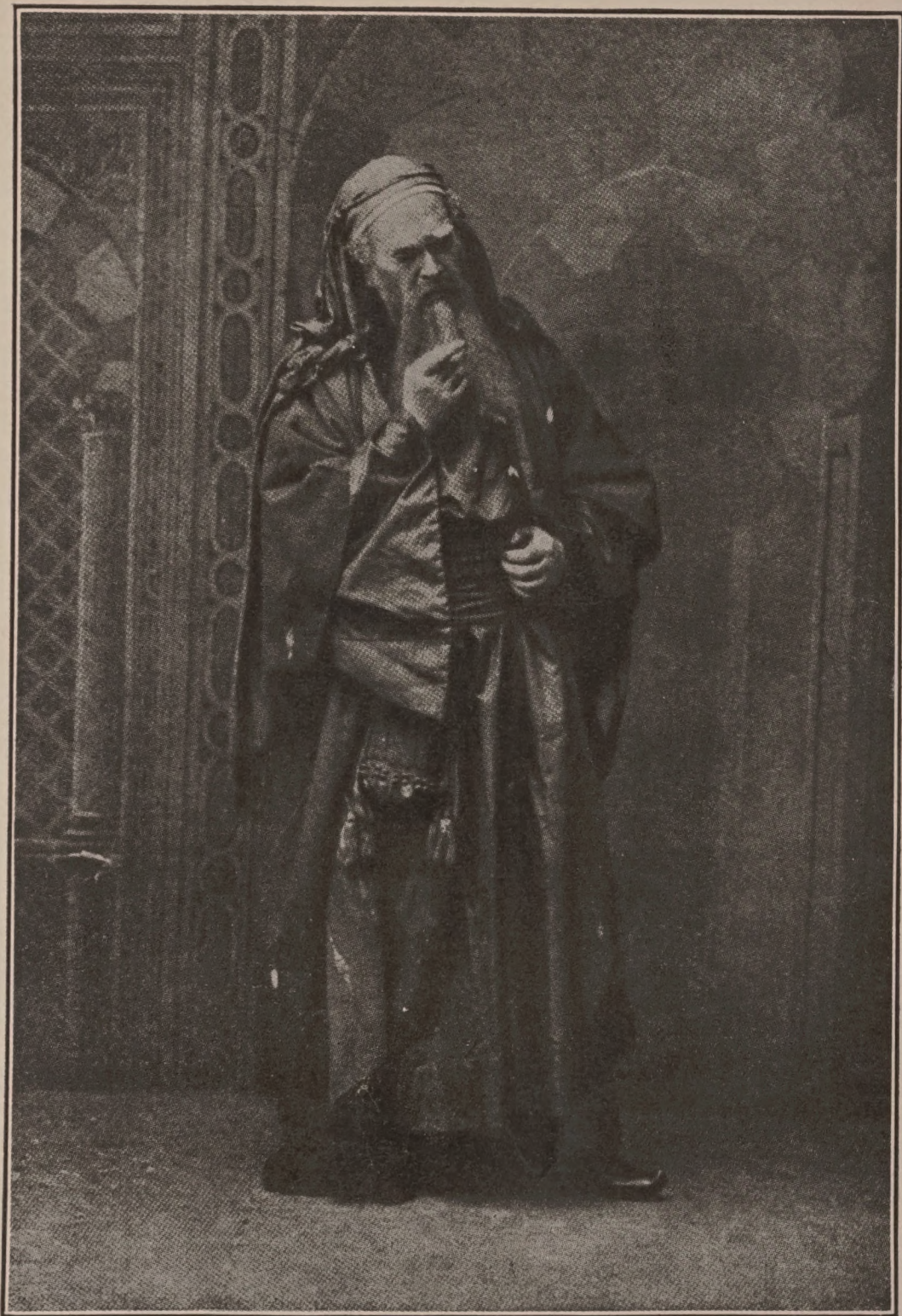
ADOLF VON SONNENTHAL

The celebrated Austrian actor, portraying the part of "Nathan"