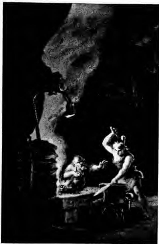
SIEGFRIED FORGING THE SWORD