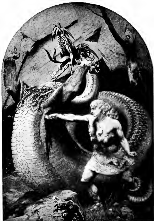
SIEGFRIED SLAYS THE DRAGON