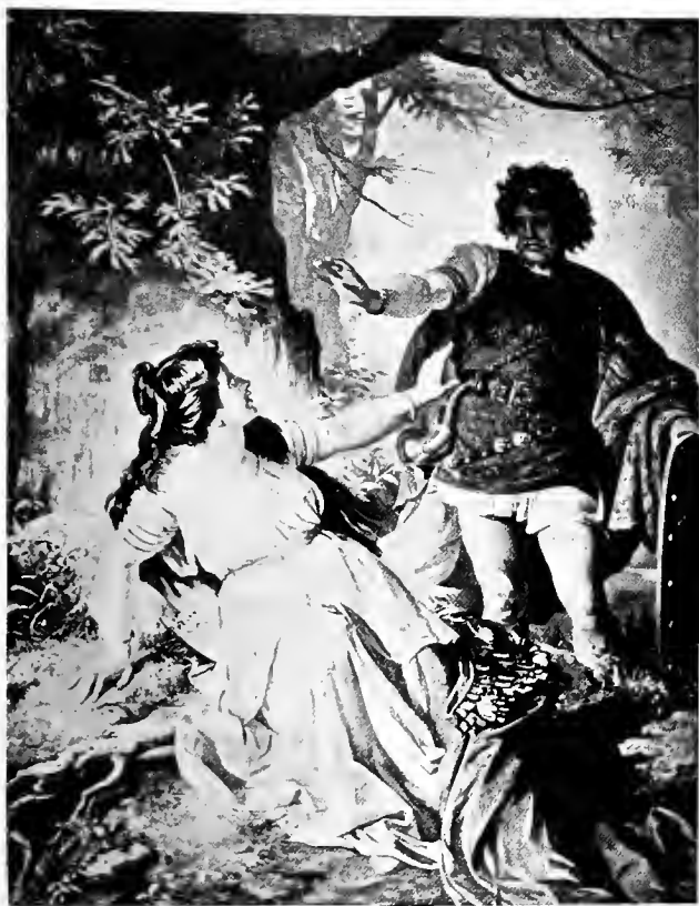
BRUNHILDE IS AWAKENED BY SIEGFRIED