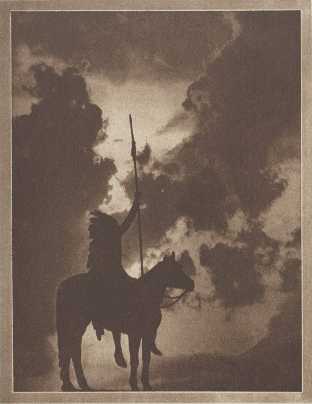
A LINCOLN PARK SILHOUETTE—Like a sentinel in the days of Fort Dearborn, this Indian statue at the Lincoln Park Gun club in Chicago stands outlined against a fiery sky.