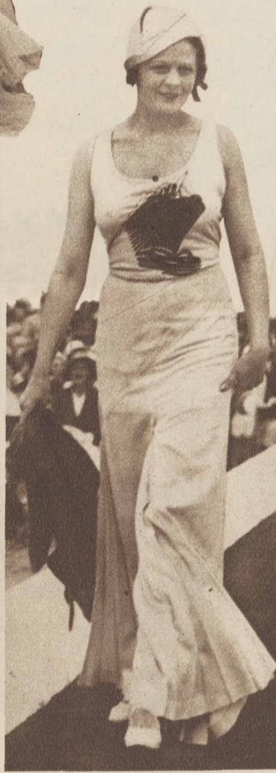
AS IT'S WORN AT DEAUVILLE—A mannequin displays the last word in embroidered beach pajamas in a style show at the French seaside resort.