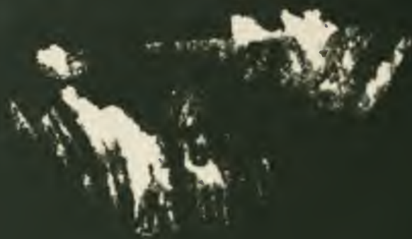
Mount Everest, the highest mountain in the world, is shown here in a black and white photograph.

The mountain is shown in a black and white photograph, highlighting its rugged terrain and snow patches.