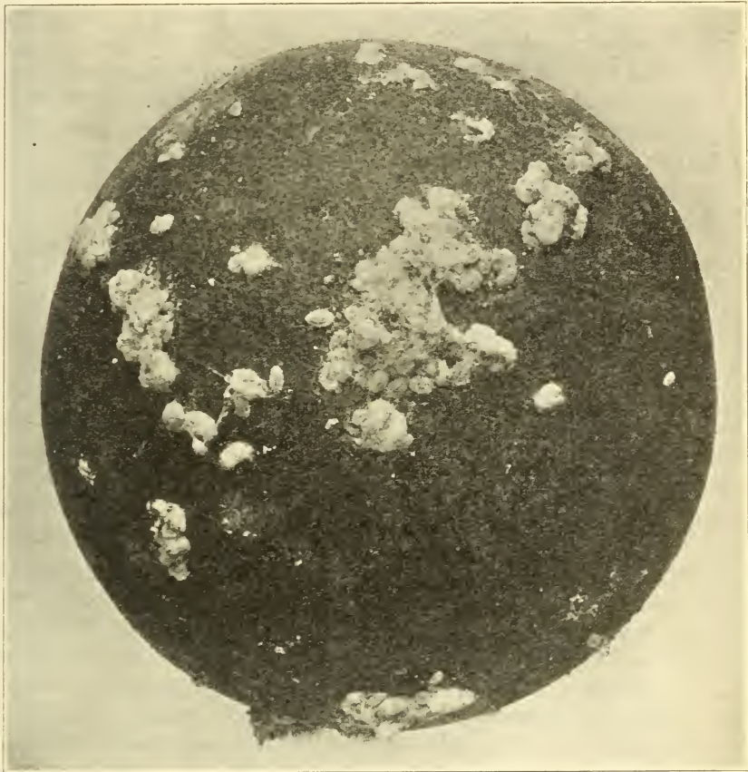
FIG. 2.—“Mealybugs on grapefruit following Bordeaux and oil emulsion for citrus scab. Mealybugs may be equally as abundant when Bordeaux and oil are not applied but such infestations are rather rare.” Yothers.

the fungus were counted either that day or the day following. The remaining insects were then counted, placed in pill boxes with fresh grapefruit rind, and the boxes placed in a moist chamber. Dead specimens were removed daily and counted. They were removed, furthermore, before the fungus fruited, in order to eliminate the chances of new infections arising within the pill boxes from the dead