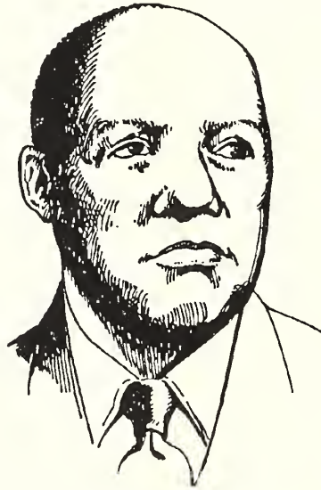
Carter Godwin Woodson 1875 - 1950

He believed the roots of racism were buried in ignorance. His research high-