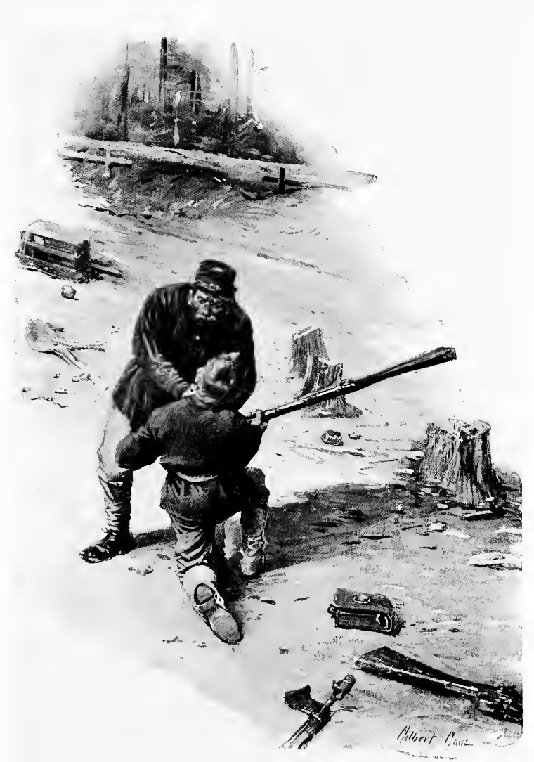
LAFE AND THE BOUNTY-JUMPER.