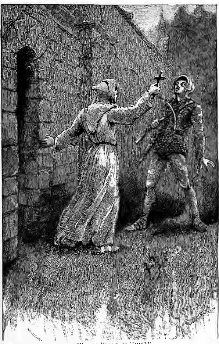
"WHOSE BLOOD IS THIS?"