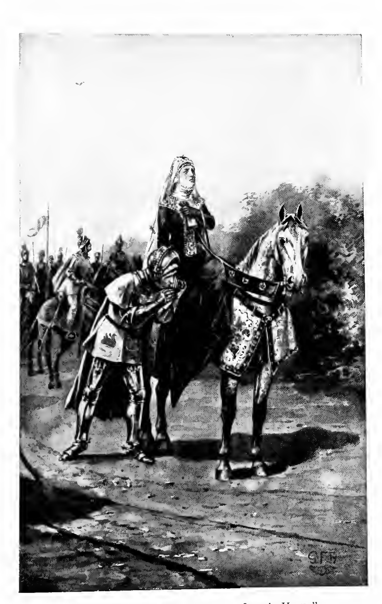
"HE ADVANCED AND KISSED THE LADY'S HAND."