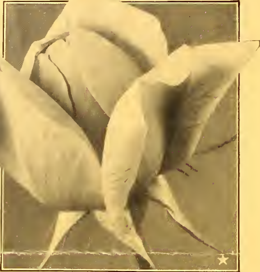
Chief of fire-colored Roses: ETOILE DE FEU

Don't dilly-dally — get your Roses now and fill every order