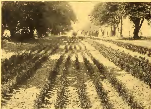
BUXUS SEMPERVIRENS (Common Box) for formal hedges§