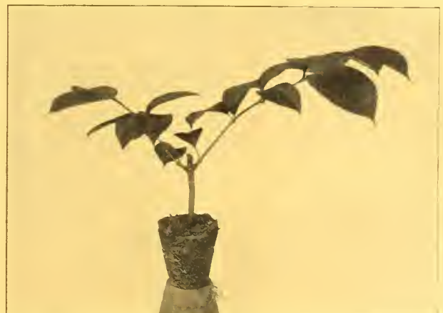
Finest in 33 years: VIBURNUM PLICATUM 3" pots

• YOUR THUMB WILL OPEN THE WAY ... TURN THE PAGE