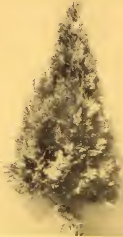
The colorful pyramid: THUJA OR. ELEGANTISSIMA*

Evergreens in sizes your customer can handle; grades for your landscaping; balls of clay-base loam