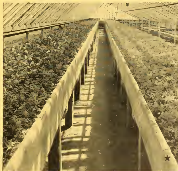
You'll root for their roots: LINING OUT EVERGREENS

Boost it for borders, small shrubs, low hedges. BERBERIS THUNBERGI MINOR: Box Barberry