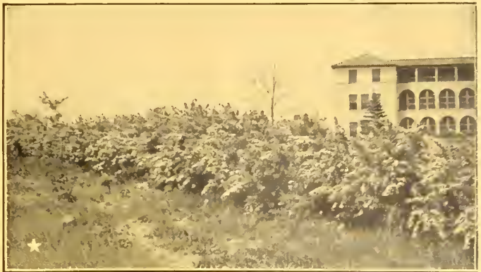
1,000 Ft. of golden bloom at West Chester, Pa., May 15, 1930 ROSA HUGONIS

Step into action ... head for prosperity ... sell idle plants ... put men to work!