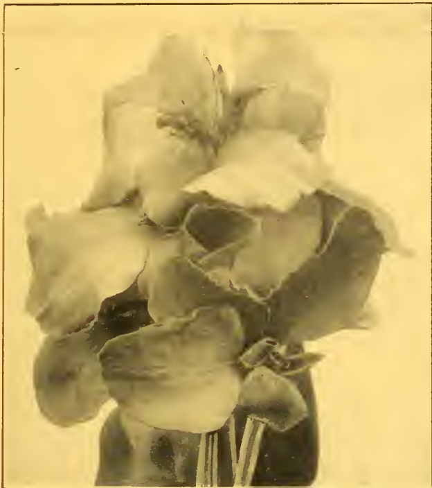
"First lady" in Cannas: MRS. HERBERT HOOVER