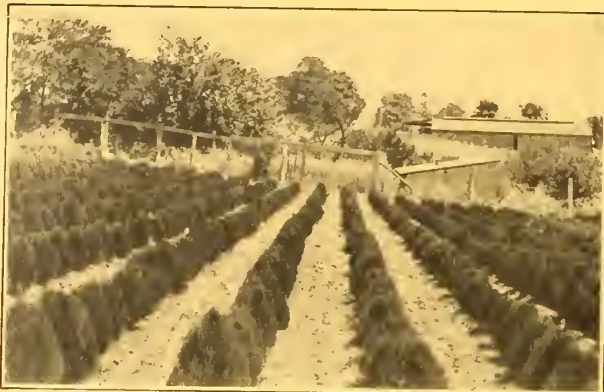
The jewel for dwarf plantings: THUJA OR. AUREA NANA†