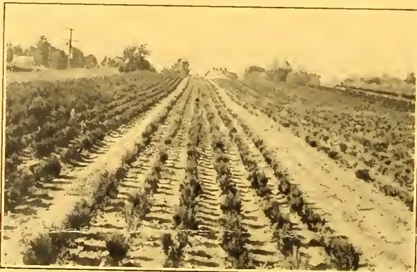
Nice size to grow on: THUJA OCC. ELEGANTISSIMA‡