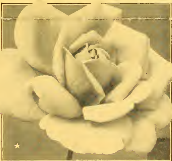
An active member of THE SPARKLING DOZEN Rose, KARDINAL PIFFL (Details next page)