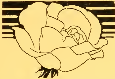
"Pink" of perfection, THE SPANISH BEAUTY: New Climbing Rose, Mme. Gregoire Staechelin