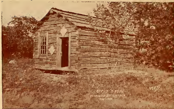
OFFUT STORE Managed by Lincoln 1831-1832