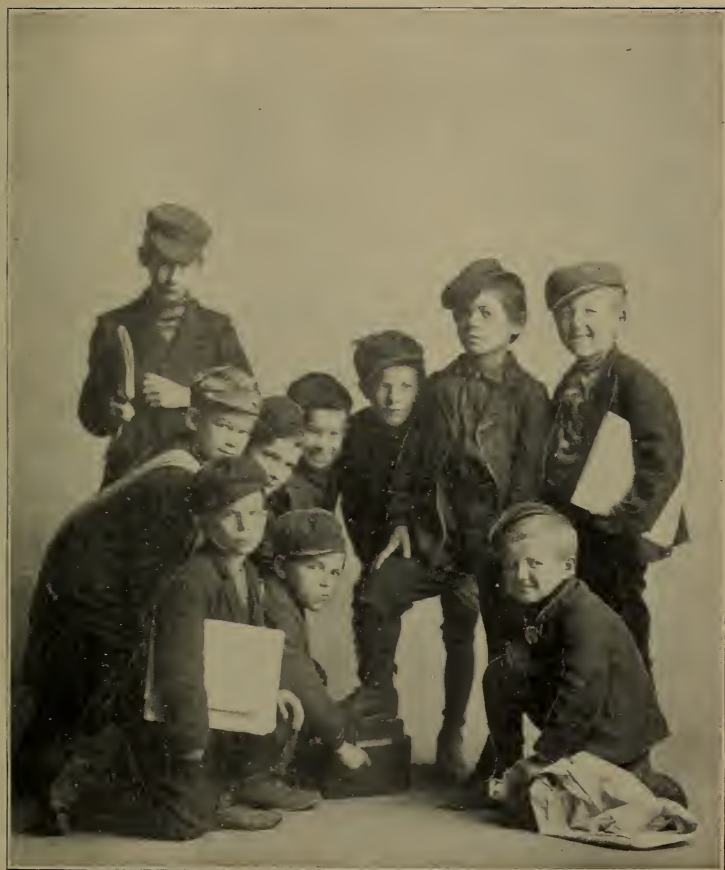
THE ORIGINAL CHARTER MEMBERS.