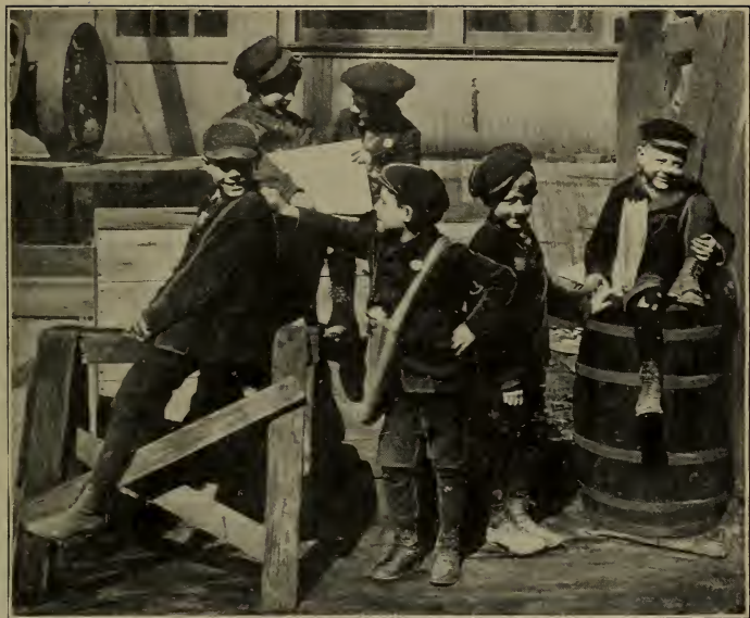
WAITING FOR THE LAST EDITION.