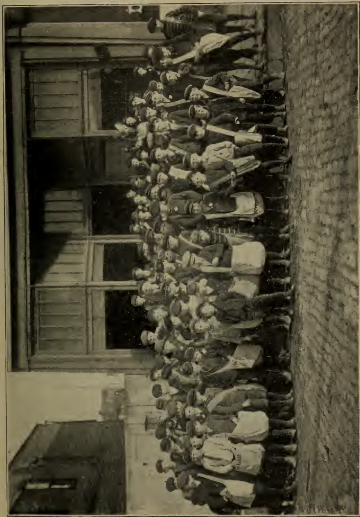
MEMBERS OF THE EAST SIDE AUXILIARY.