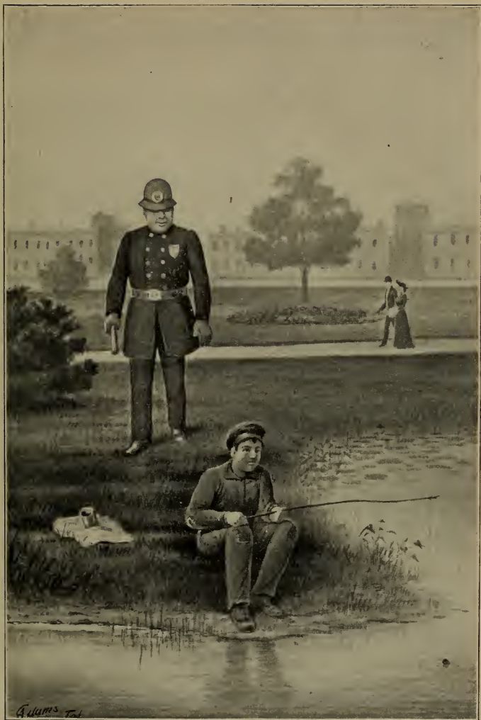
“HE WAS FISHING IN THE LAKE.”