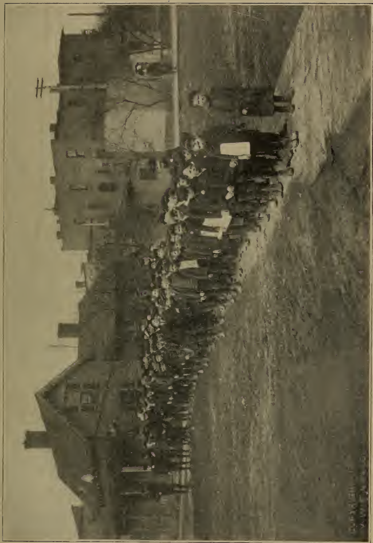
LINING UP READY TO GO TO CHURCH.