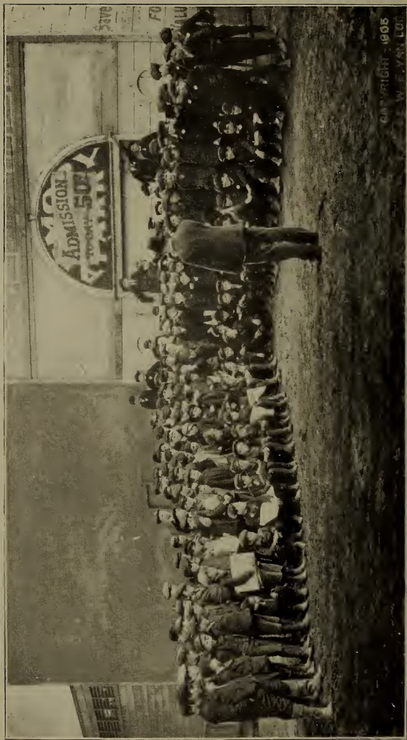
THE PRESIDENT TALKING TO THE NEWSBOYS.