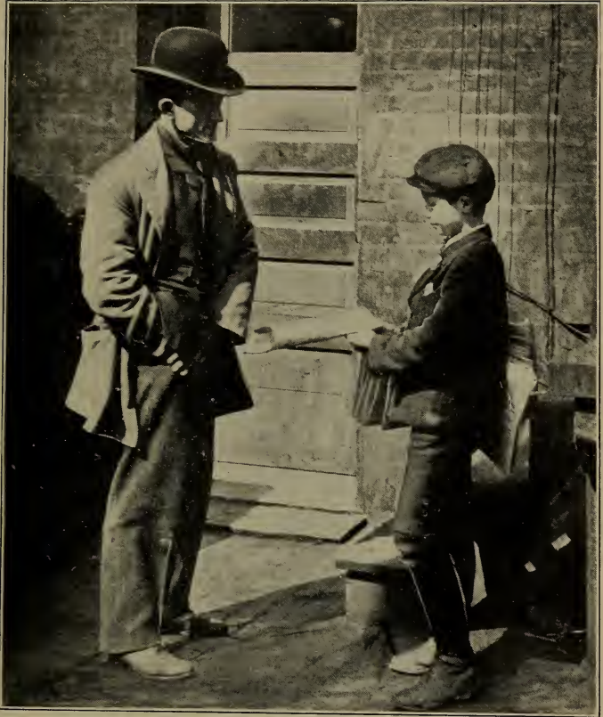
FIRST SALE OF THE DAY.