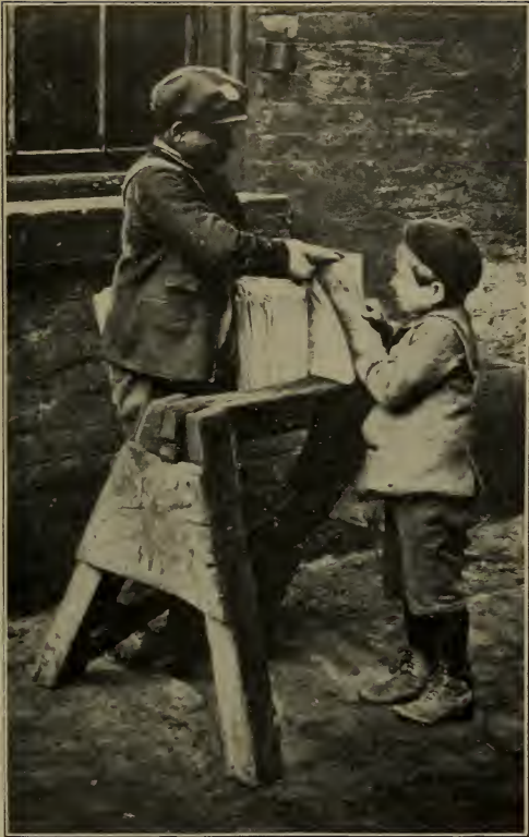
DIVIDING THE PAPERS.