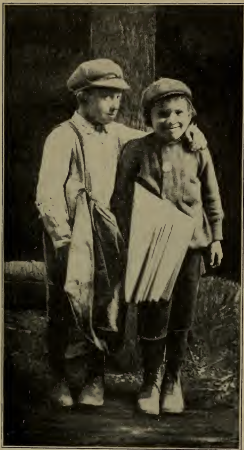
TWO NEW MEMBERS.