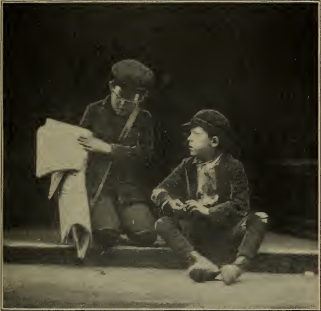
GETTING FAMILIAR WITH THE HEADLINES.