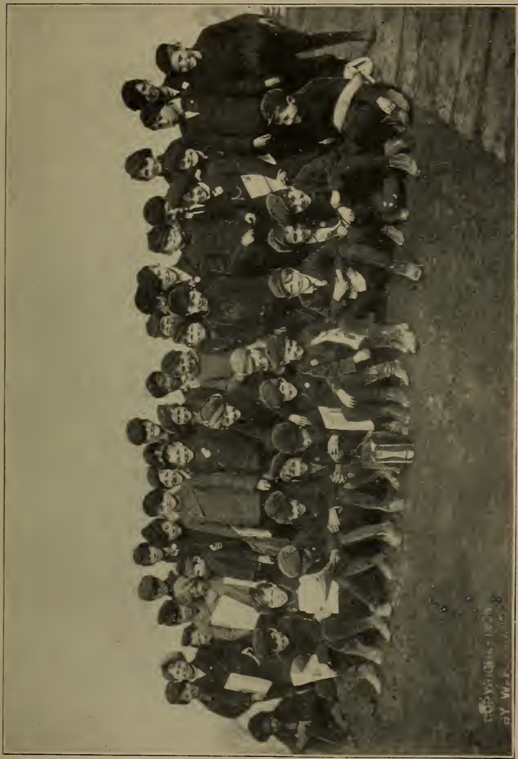
A BUNCH OF SELLERS.