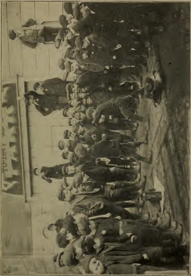
PASTIME — THE BEGINNING.