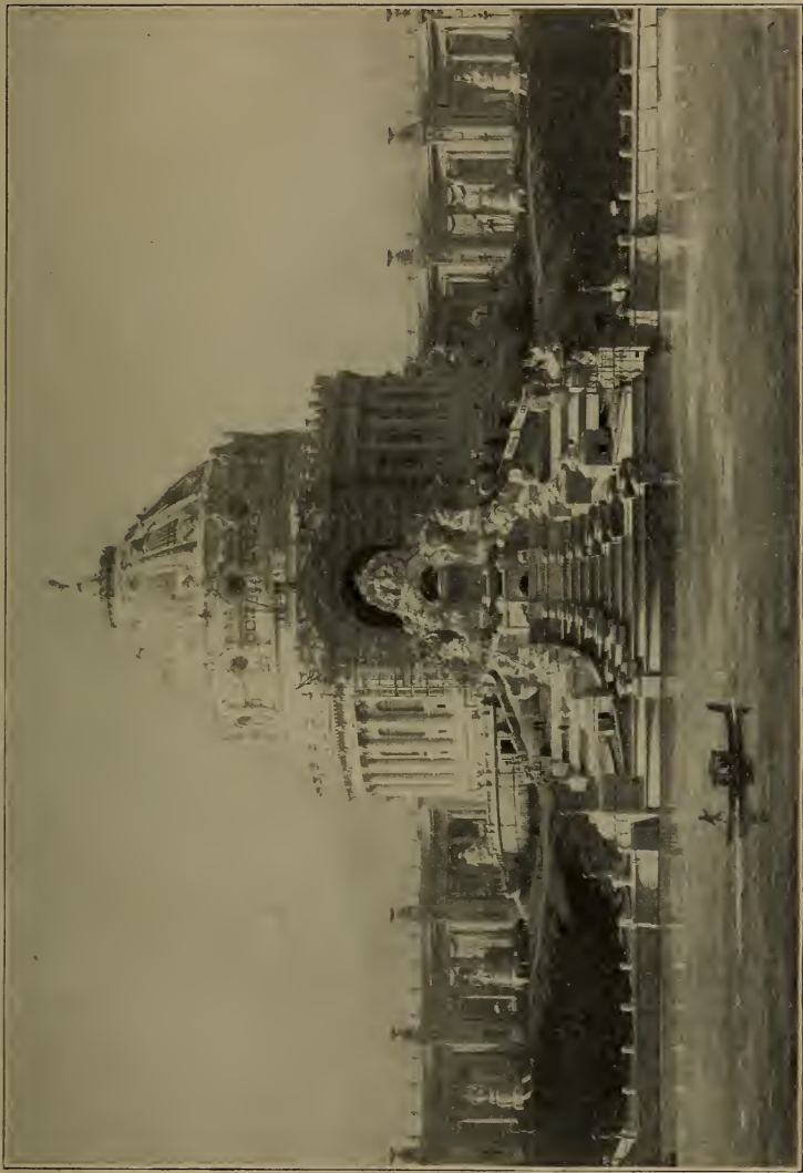
FESTIVAL HALL. WHERE THE NATIONAL NEWSBOYS' ASSOCIATION WAS ORGANIZED, AUGUST 16, 1904.