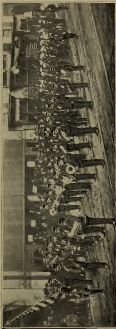
NEWSBOYS' BAND AND CADETS—READY TO START FOR WASHINGTON, D. C., TO PARTICIPATE IN THE INAUGURAL PARADE OF PRESIDENT ROOSEVELT, MARCH 4, 1905.