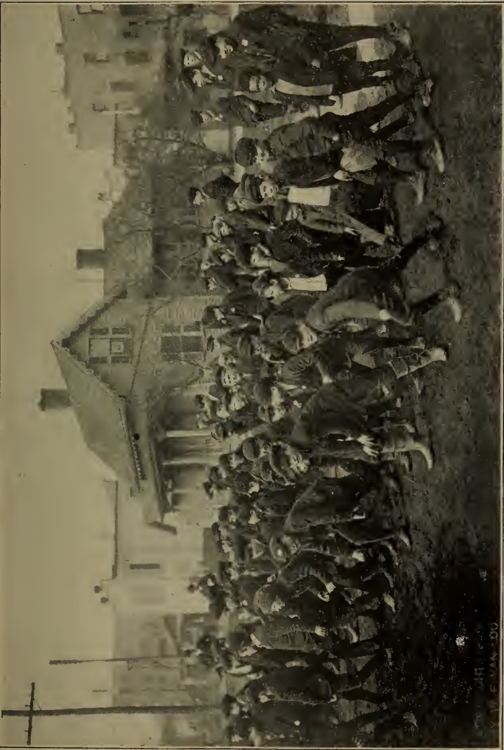
READY TO START FOR THE FIRST CHRISTMAS DINNER.