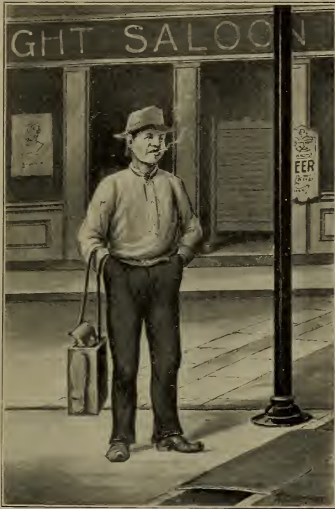
THE TOUGH FROM MARKET SPACE.