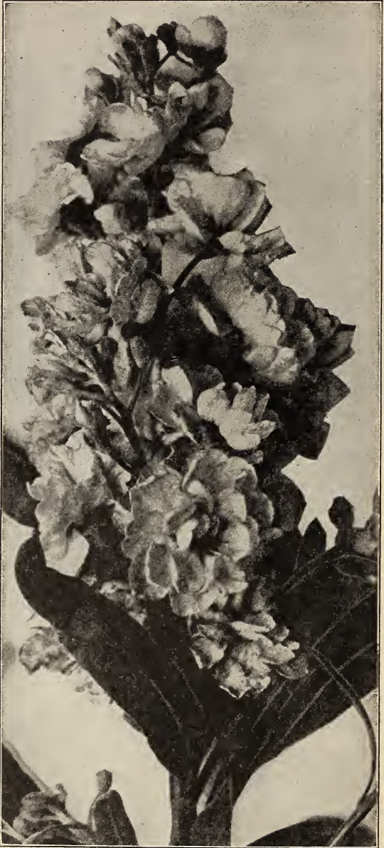
Nice Giant Stocks