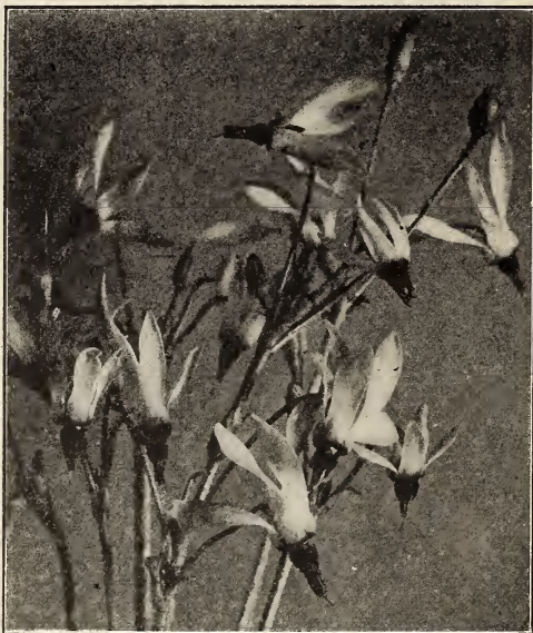
Dodecatheon clevelandii —"Shooting Star"

Dicentra chrysantha . "Golden Ear Drops." Perennial, 3 to 5 feet high. Finely cut glaucous foliage and rich yellow flowers. Pkt., 15c; ¼ oz., $1.00.