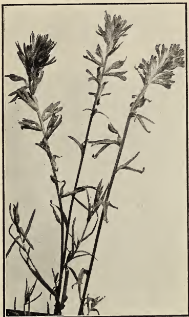
Castilleja californica —"Indian Paint Brush"

Floerkea douglasii . "Meadow Foam." Annual, of low spreading habit; flowers cream-colored. Prefers a moist location. Pkt., 10c; oz., 50c.