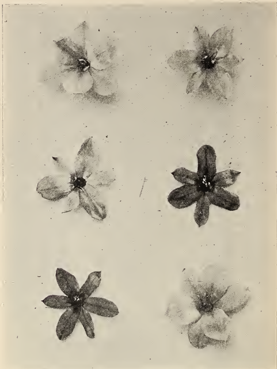
General Pershing Fanny Lyon Marion Welsh

Giant Lilac. Soft lilac, very large. Plants grow 4 to 5 feet high. Each, 15c; doz., $1.50; 100, $10.00.