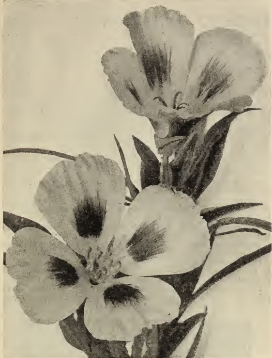
Godetia grandiflora—"Farewell to Spring"