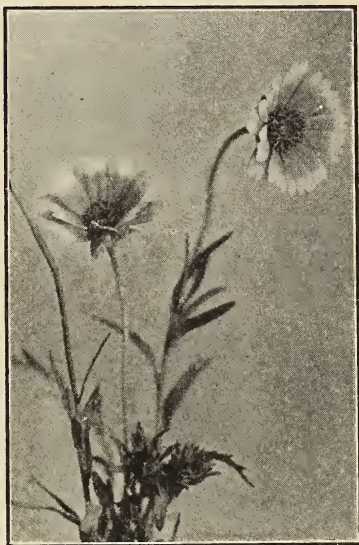
Layia elegans —"Tidy Tips"

Phacelia tanacetifolia . "Wild Heliotrope." Annual, 1½ to 2½ feet high. Flowers lavender blue. Pkt., 10c; oz., 35c; lb., $4.00.