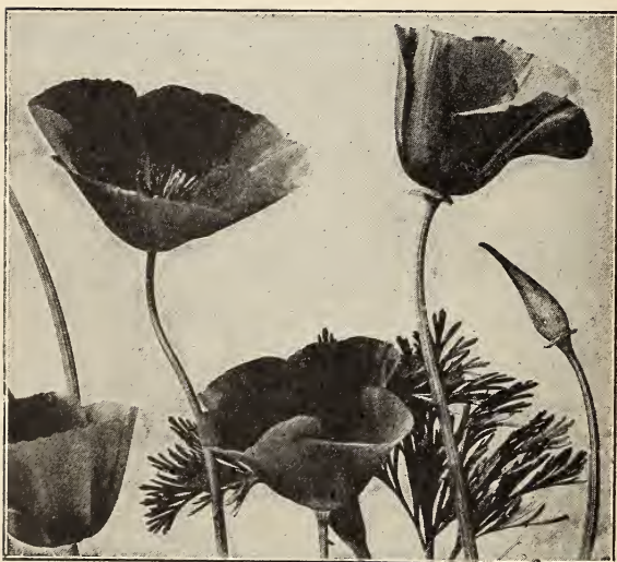
Eschscholtzia californica—"California Poppy"