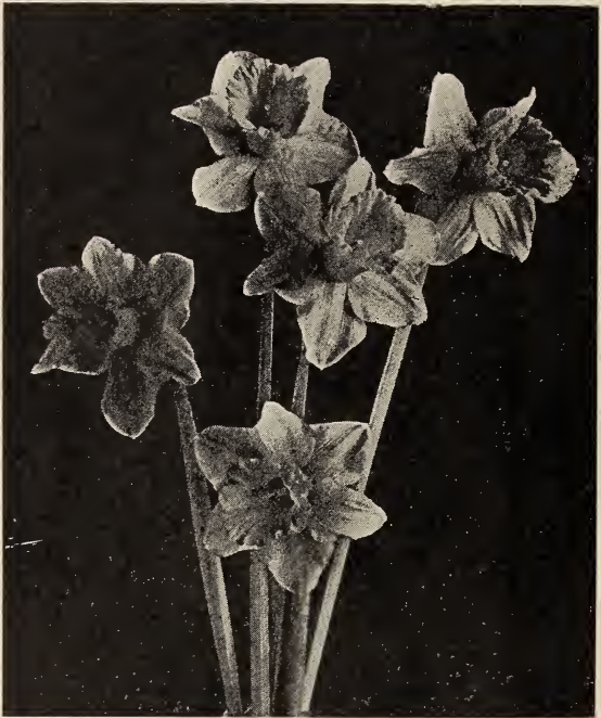
Single Narcissus—Sir Watkin

Chinese Sacred Lily. White with yellow cup. Large bulbs. Each, 20c; doz., $2.00.