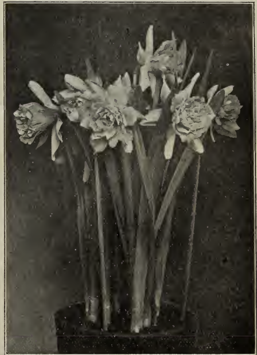
VAN SION NARCISSUS

Good for forcing; flowering six weeks after planting; fine for counter trade. H. H. Berger & Co. first imported this Narcissus into the United States from China for the florists' trade. See our Special Offer on a front page.