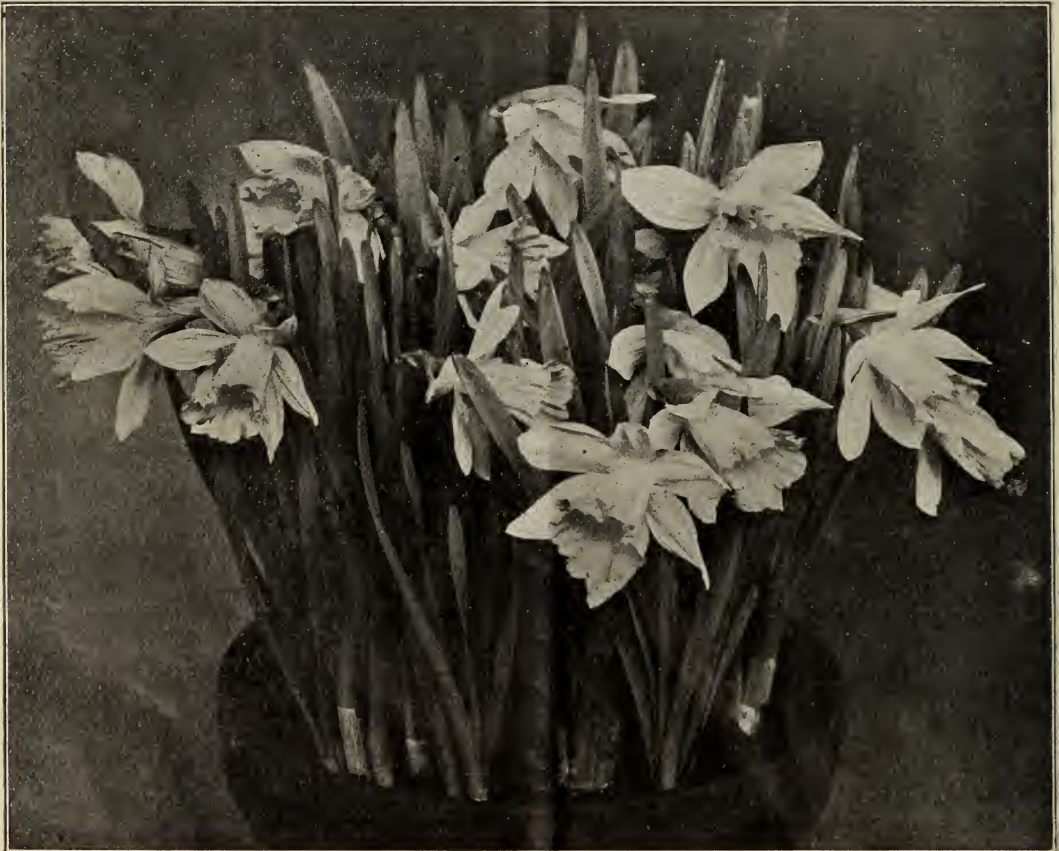
SINGLE FLOWERED NARCISSUS