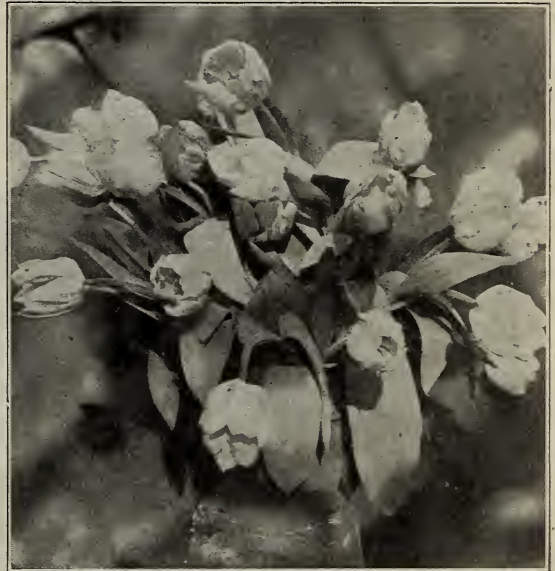
TULIP LA REINE