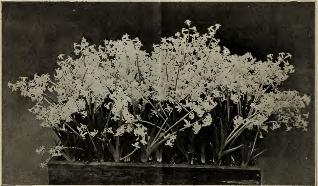
FRENCH ROMAN HYACINTHS