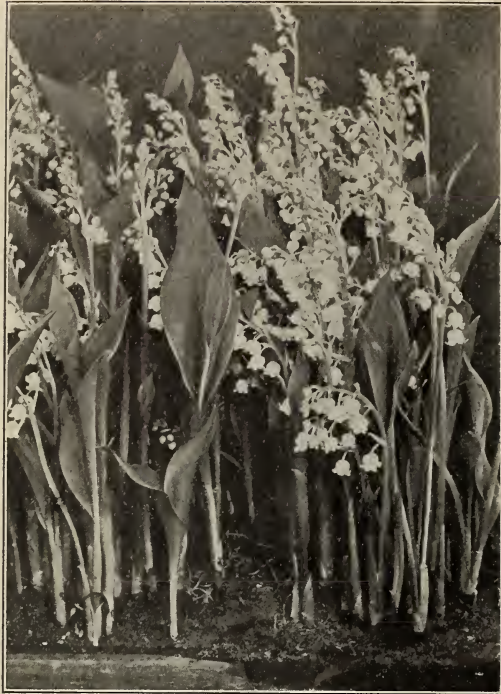
LILY OF THE VALLEY