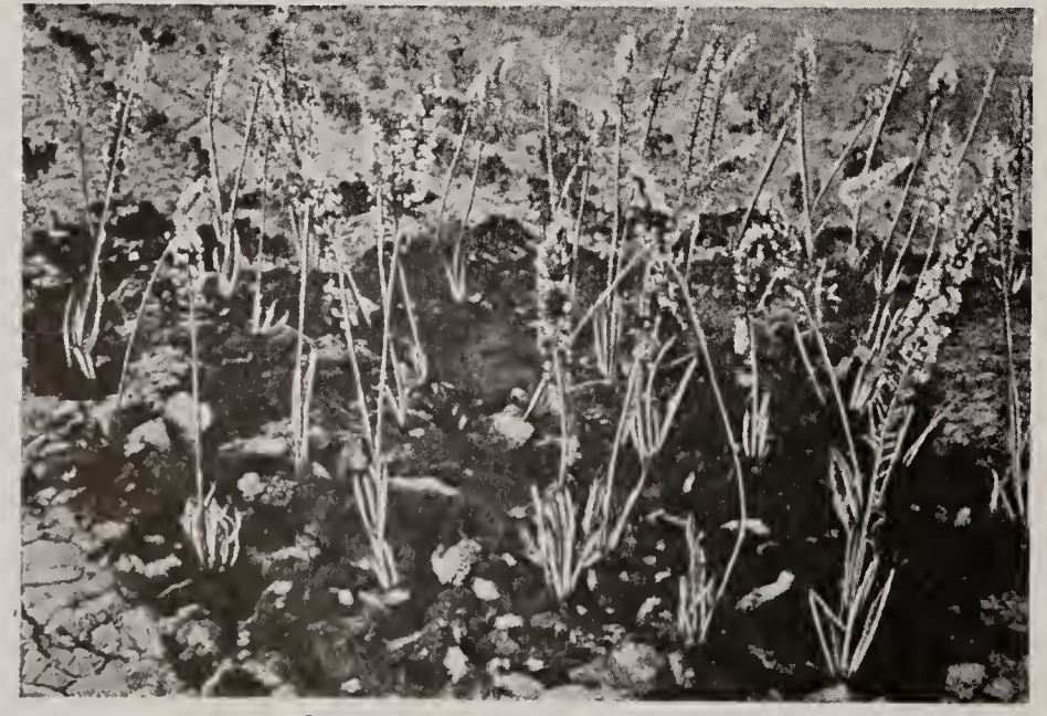
View of clump of wild-growing Eremurus Olga