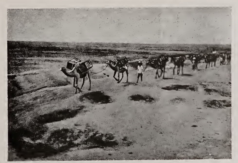
Caravan delivering bulbs to nearest collecting station