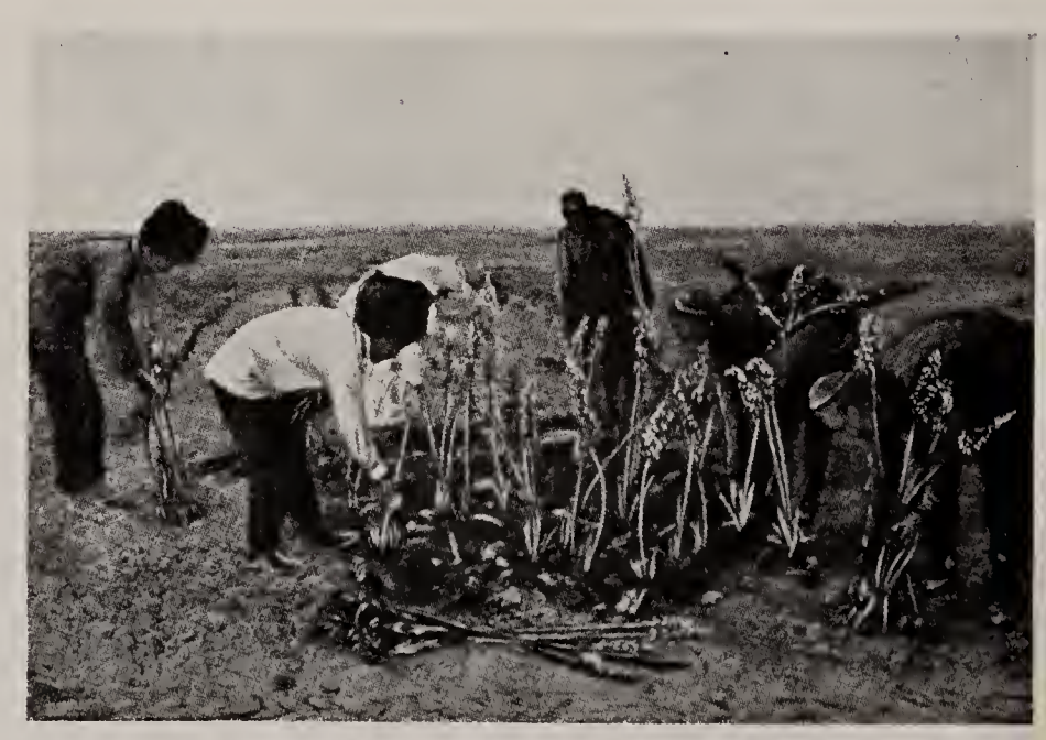
Digging up Eremuri in Turkestan