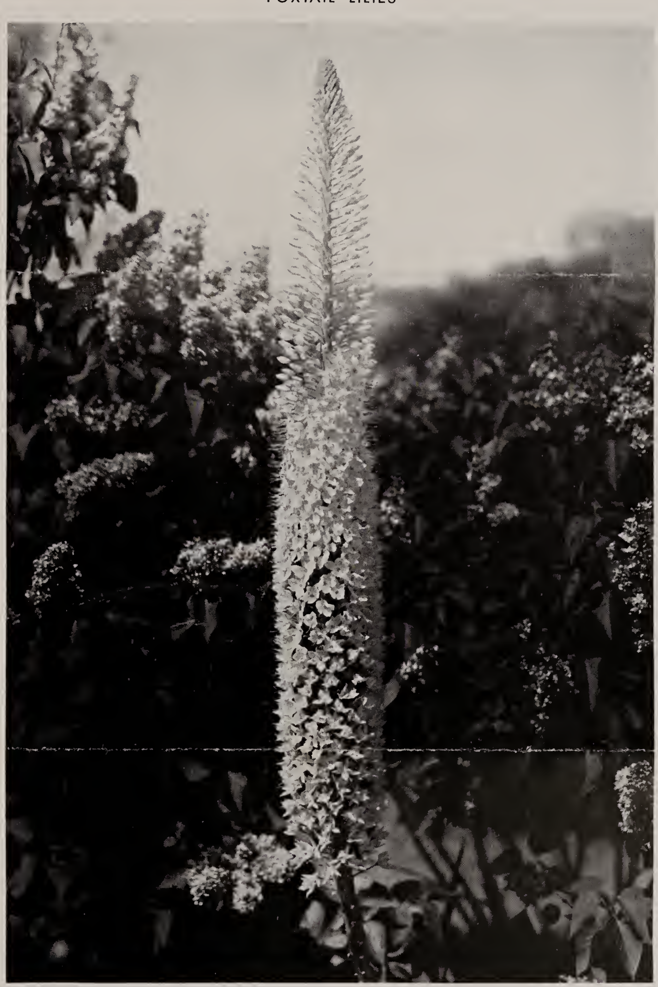
Eremurus Himalaicus at "PARADOU