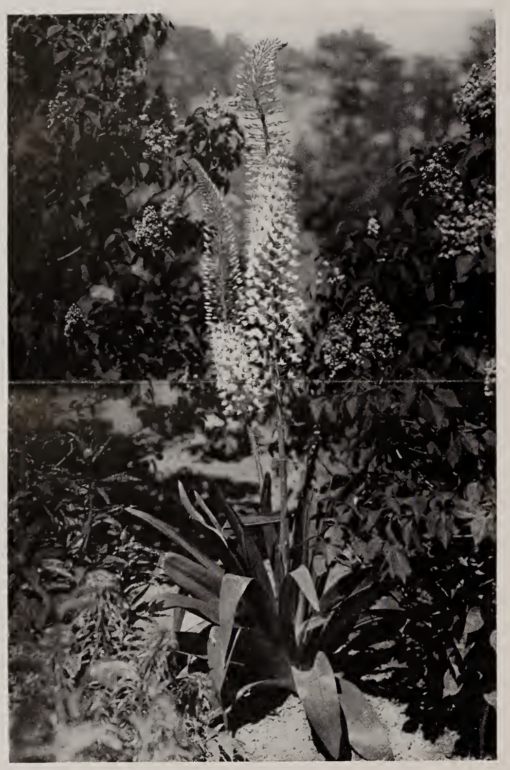
Eremurus Elwesii at "PARADOU"