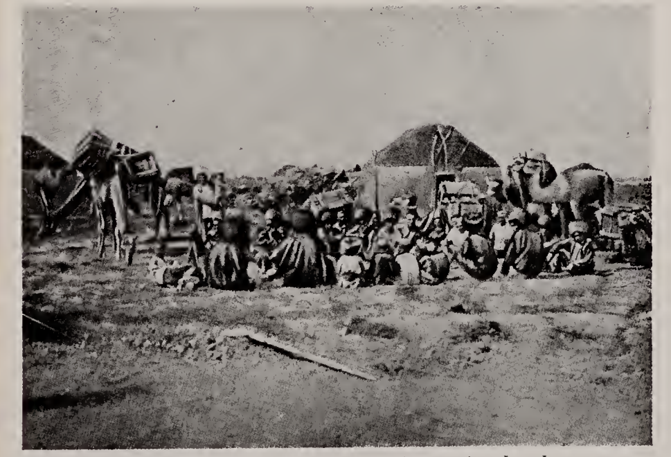
Bivouac of bulb-collecting expedition in the desert