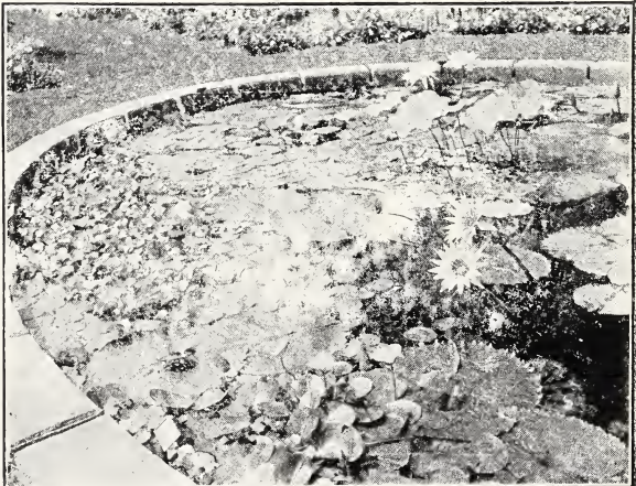
STAR WATER LILIES, LOTUS, AND WATER POPPIES

The fish fancier, too, will delight in the tremendous variety of his favorites here described.