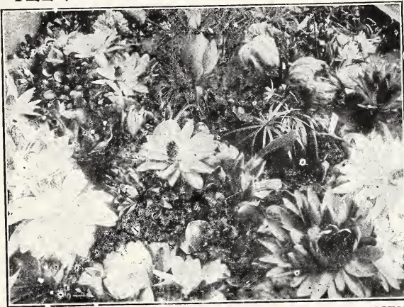
"AN EXHIBITION OF GIANT NIGHT-BLOOMING WATERLILIES"

GLADSTONE. A favorite, free-blooming white. Each, $2.00