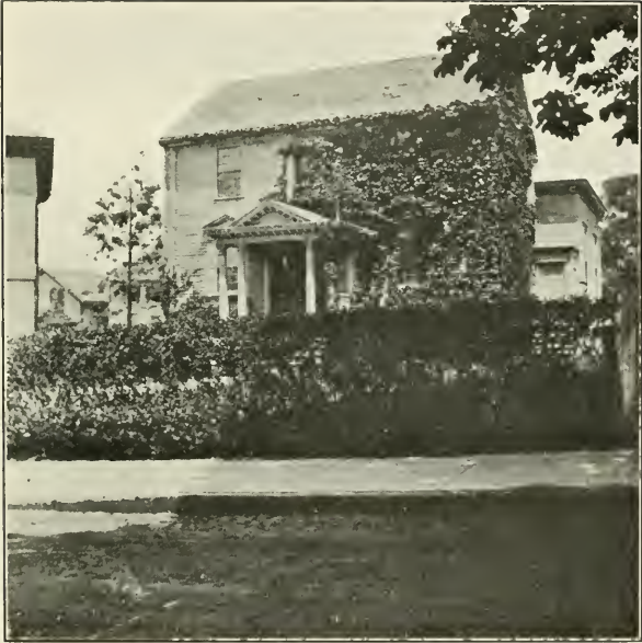
ORIGINAL SEVENTH DAY BAPTIST MEETING HOUSE ERECTED 1729 NOW THE MUSEUM OF THE NEWPORT HISTORICAL SOCIETY