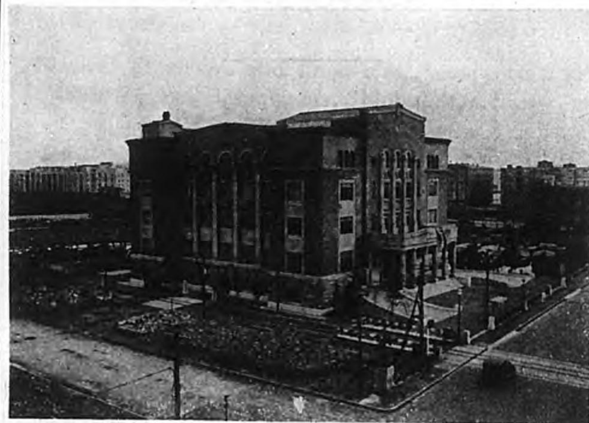
The Kobe Chamber of Commerce and Industry Building, Kyobashi, Kobe

Accurate information regarding Commerce, Industry and kindred subjects in Japan promptly ✂ supplied on request ✂