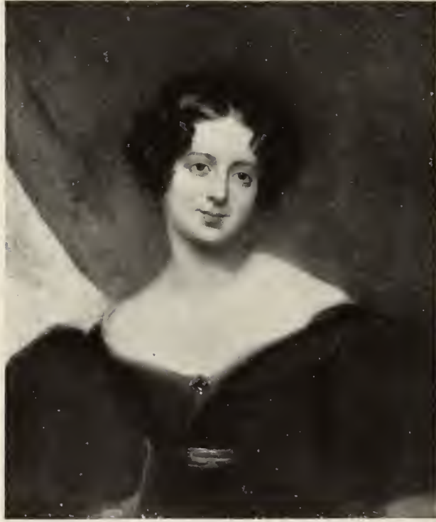
SIR THOMAS LAWRENCE, P.R.A. (PERIOD OF)