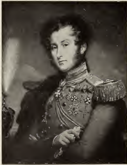
SIR WILLIAM BEECHEY, R.A. (?)