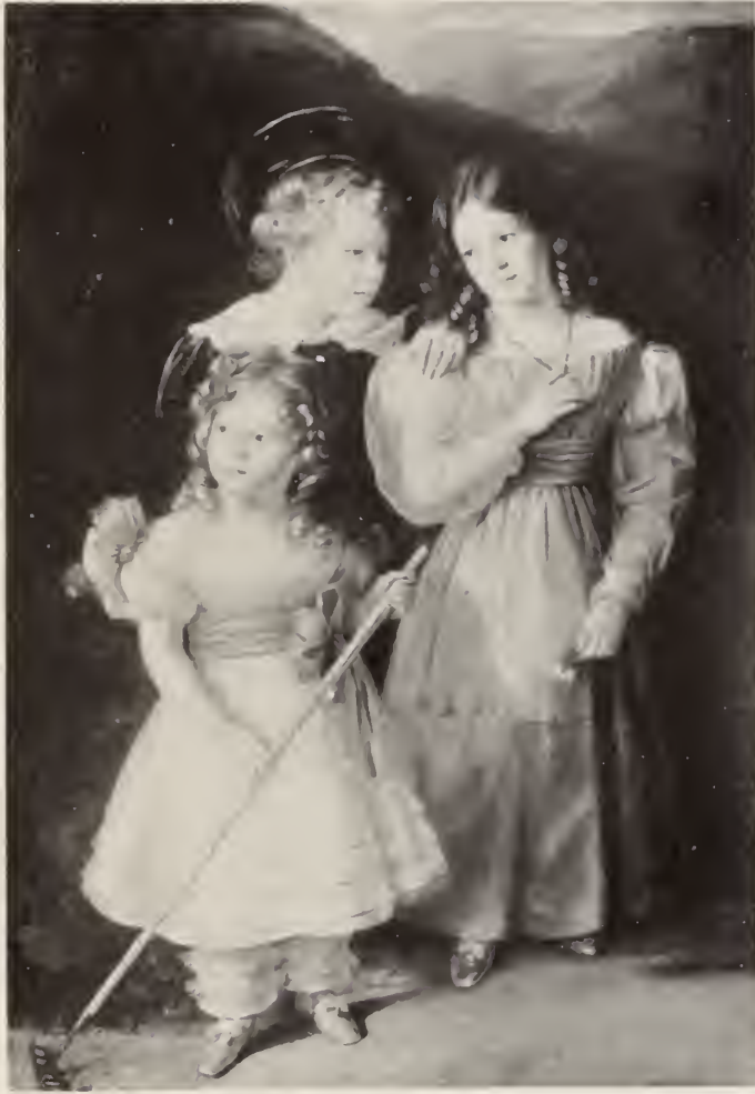
ENGLISH SCHOOL (ABOUT 1830)