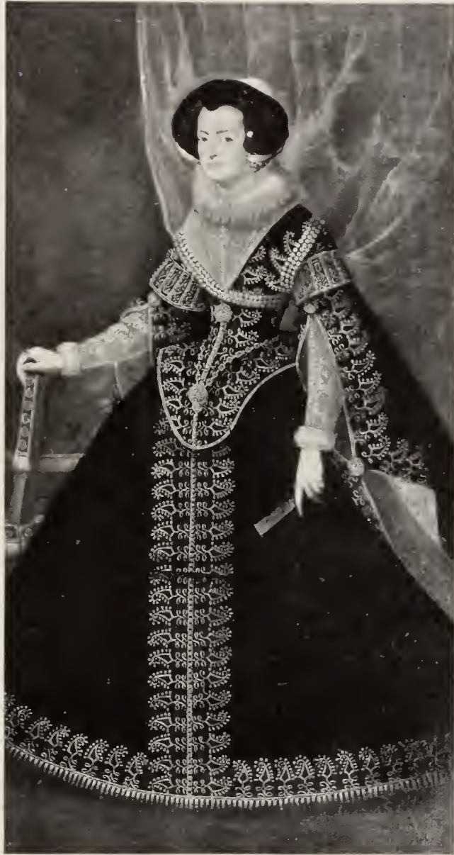
NO. 57—PORTRAIT OF A LADY BY JUAN BAUTISTA DEL MAZO