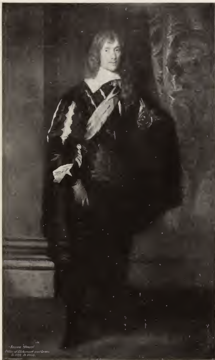
No. 67—JAMES STUART, DUKE OF GORDON AND LENOX AFTER VAN DYCK