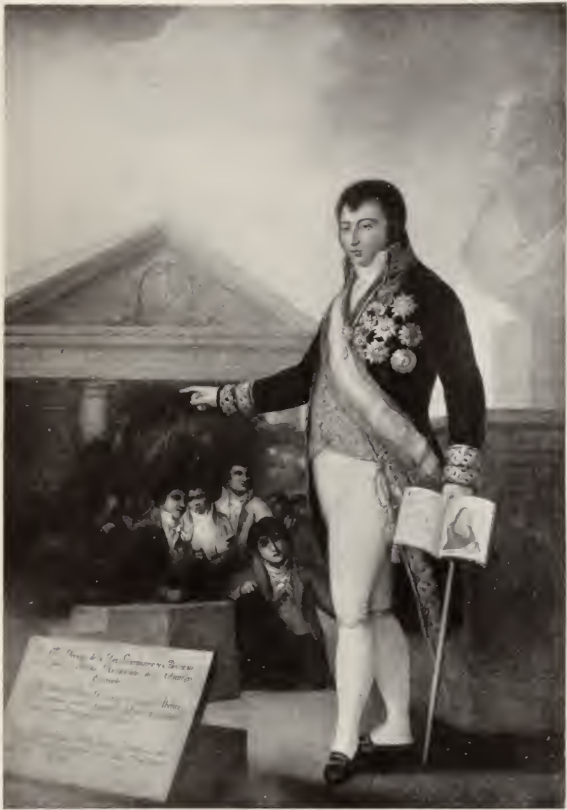
NO. 54—PORTRAIT OF THE PRINCE OF PEACE BY FRANCISCO JOSÉ DE GOYA Y LUCIENTES