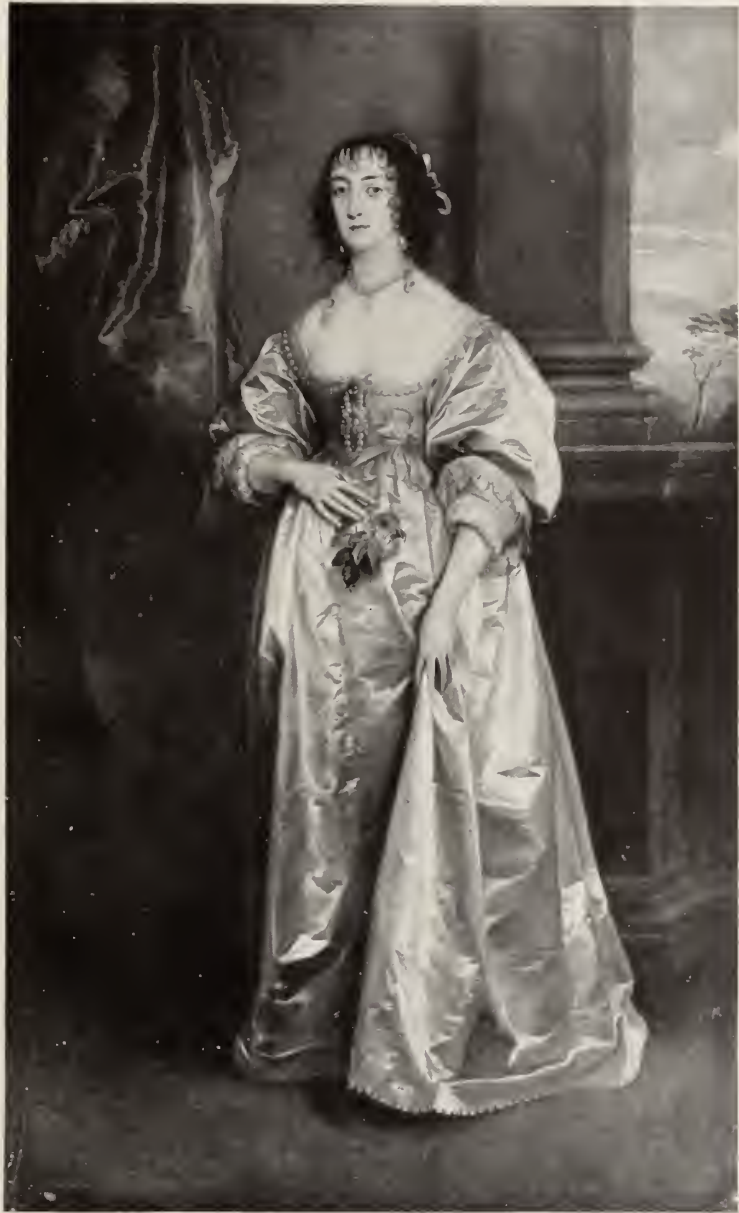
No. 66—DAUGHTER OF THE COUNT OF HOLLAND BY SIR ANTHONY VAN DYCK