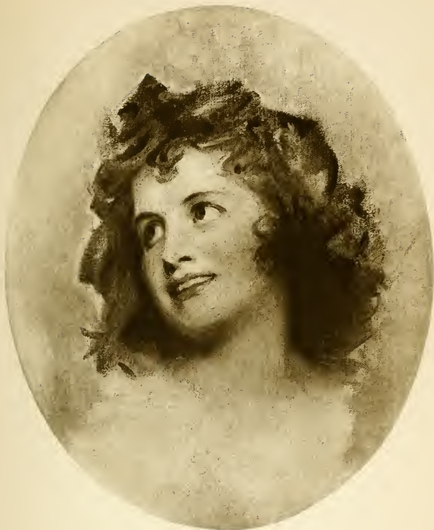
LADY HAMILTON AS EUPHROSYNE FROM THE PAINTING BY ROMNEY, IN THE POSSESSION OF G. HARLAND PECK, ESQ.