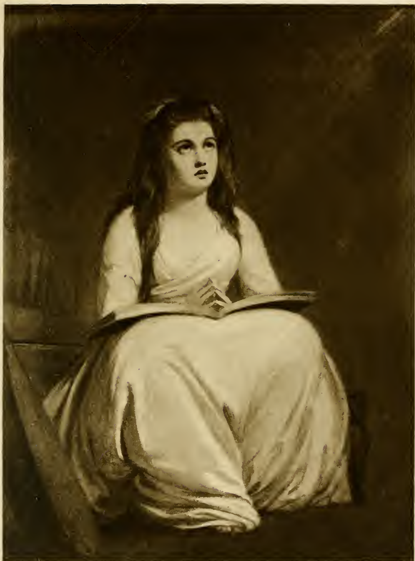
LADY HAMILTON AS ST. CECILIA FROM THE PAINTING BY ROMNEY, IN THE POSSESSION OF WATSON FOTHERGILL, ESQ.