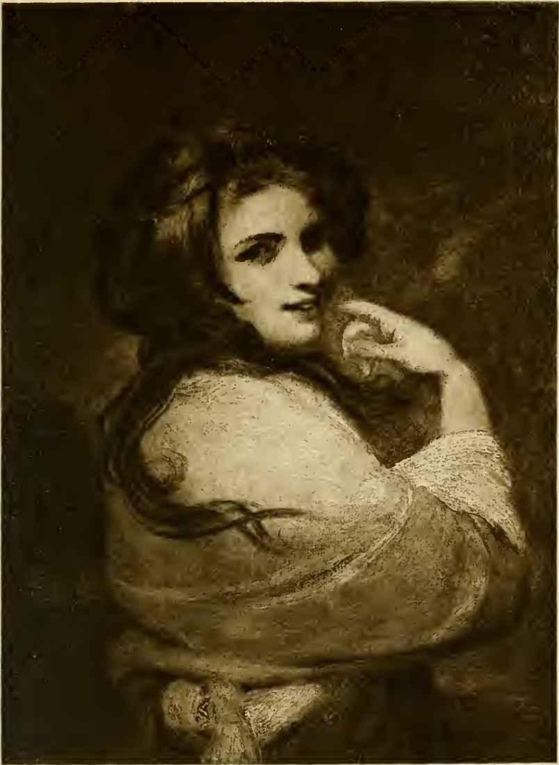
LADY HAMILTON AS A BACCHANTE FROM THE PAINTING BY SIR JOSHUA REYNOLDS, IN THE POSSESSION OF THE EARL OF DURHAM