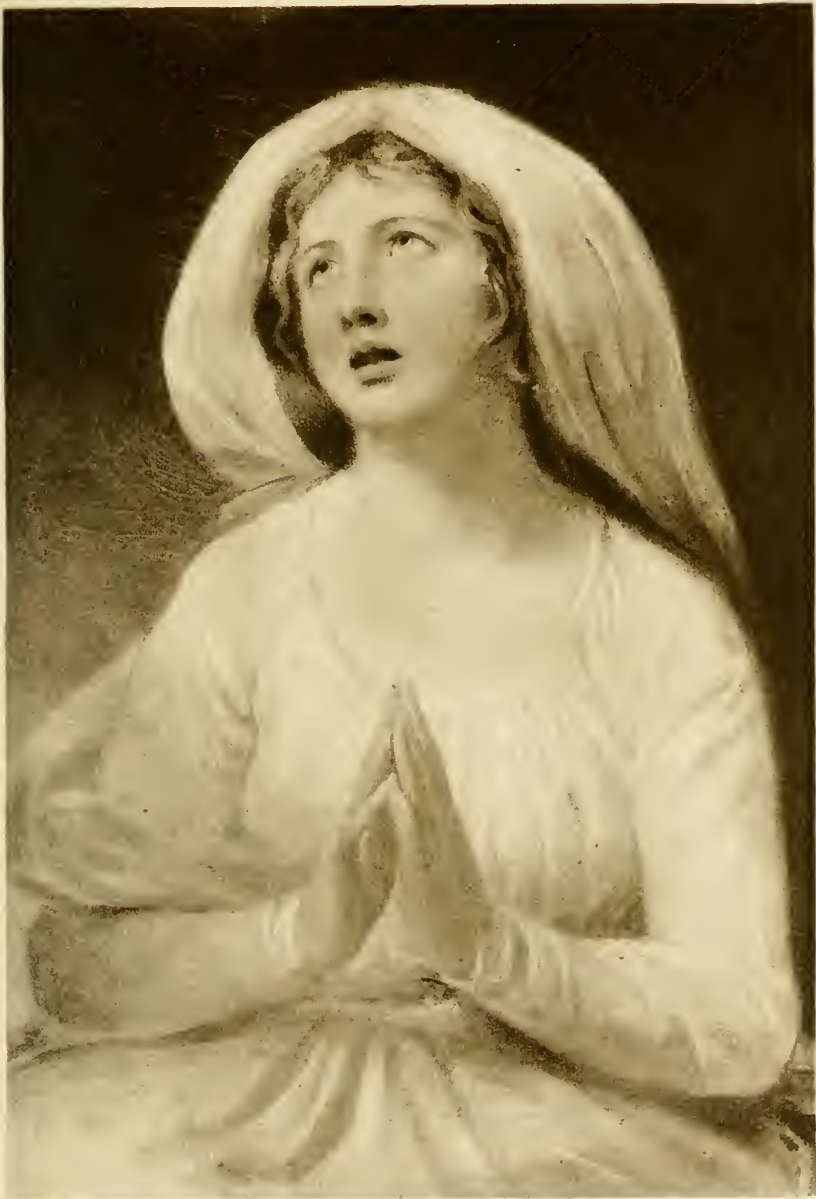
LADY HAMILTON; THE NUN FROM THE PAINTING BY ROMNEY, IN THE POSSESSION OF MONSIEUR M. SEDELMEYER