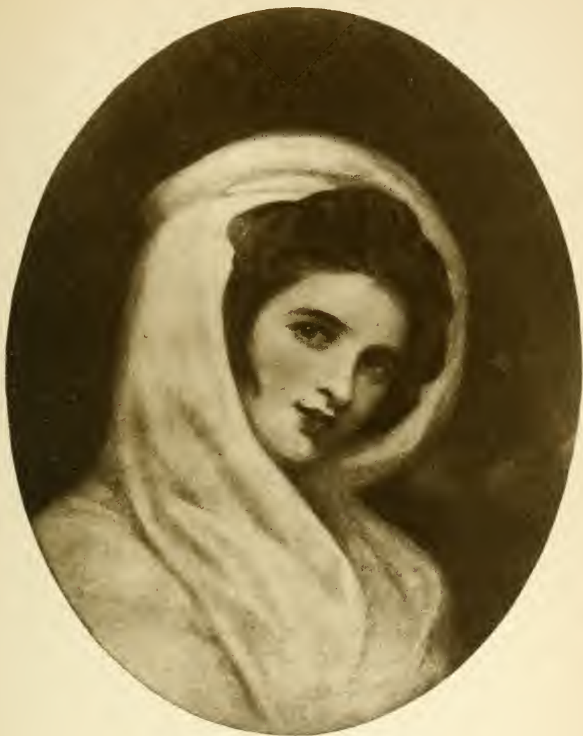
LADY HAMILTON IN A WHITE HOOD FROM THE PAINTING BY ROMNEY, IN THE POSSESSION OF LORD GLENCONNER