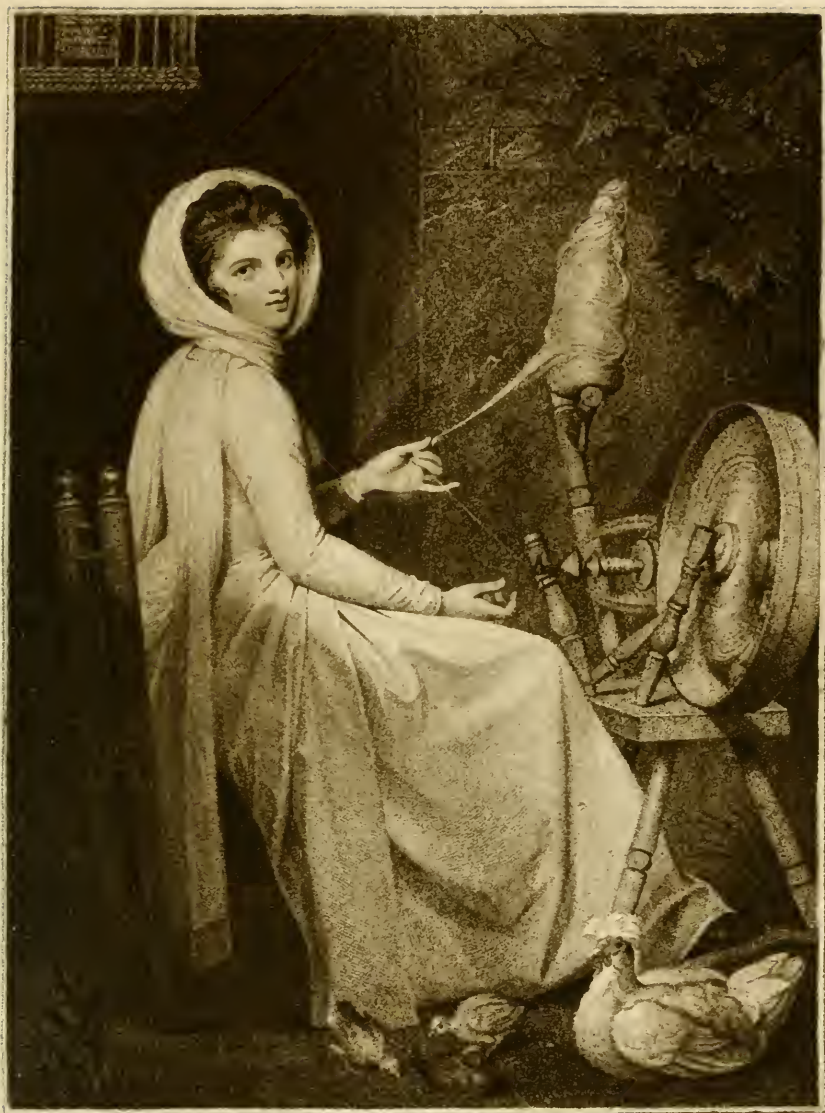
THE SPINSTRESS FROM THE ENGRAVING BY T. CHEESEMAN, AFTER THE PAINTING BY ROMNEY