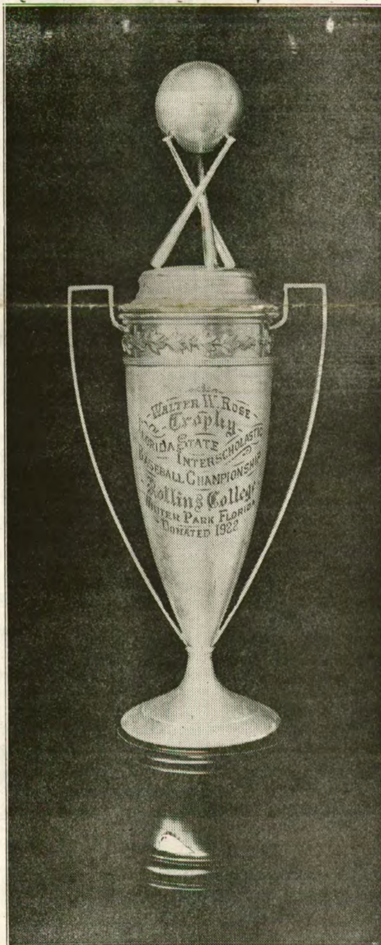
WALTER W. ROSE TROPHY