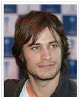
guapo/guapa – handsome, beautiful