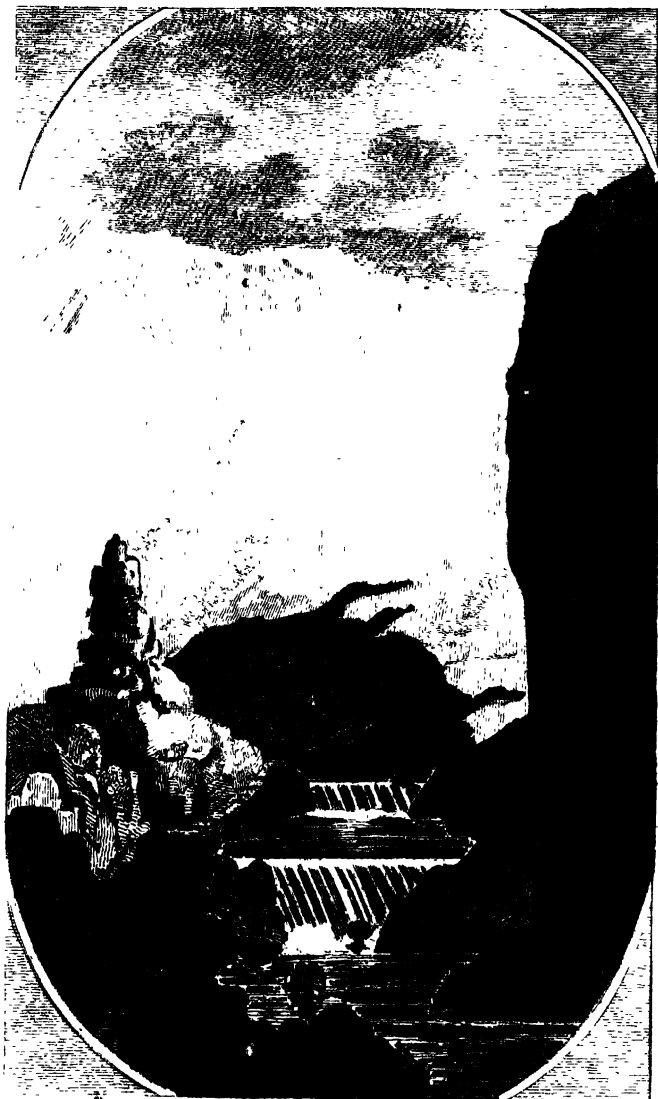
The Fountain of Vaucluse.