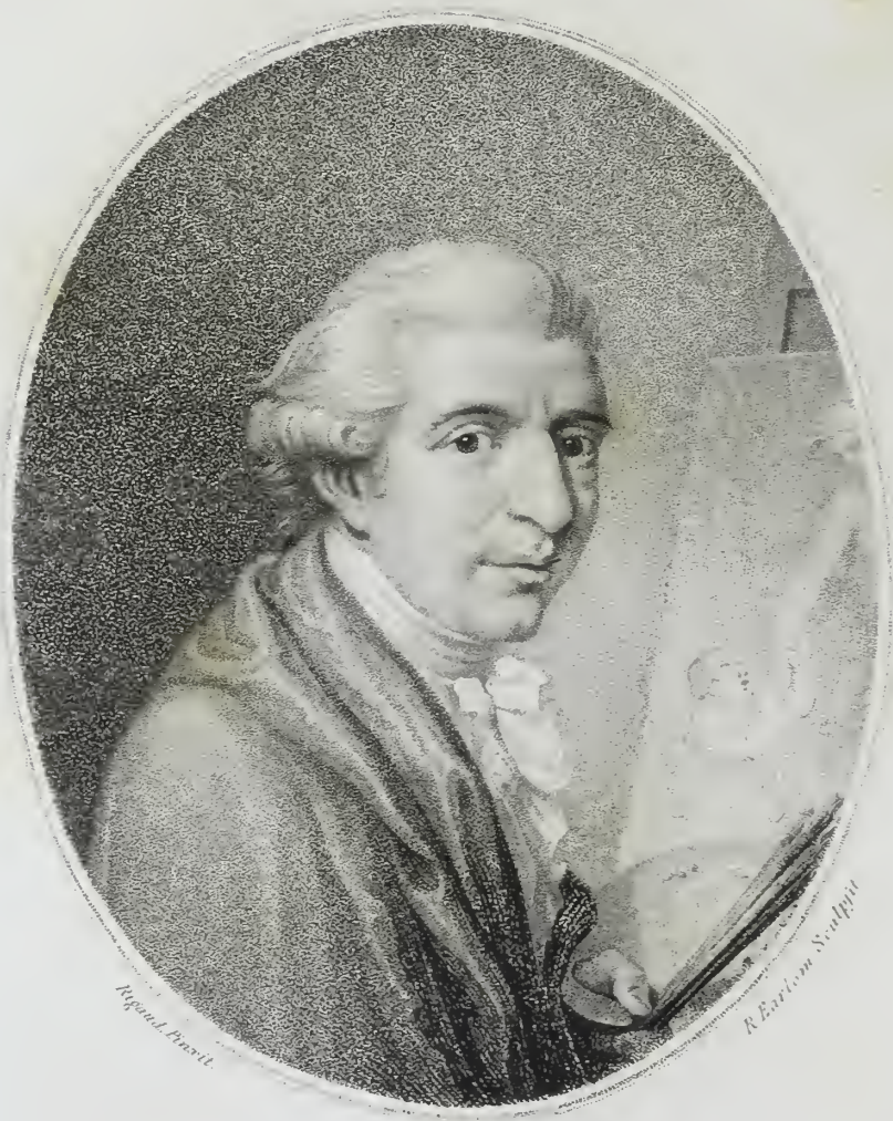
GIOVAN BATTISTA CIPRIANI, ESQ. R.A.

Published Sep r 20 h 1789 by John & Joseph Boydell Cheapside & at the Shakspeare Gallery Pall Mall London