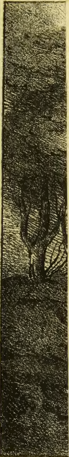
T. Gainsborough Del.