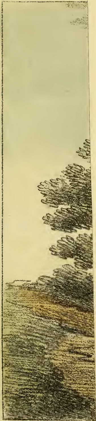
T. Gainsborough, th. Del.