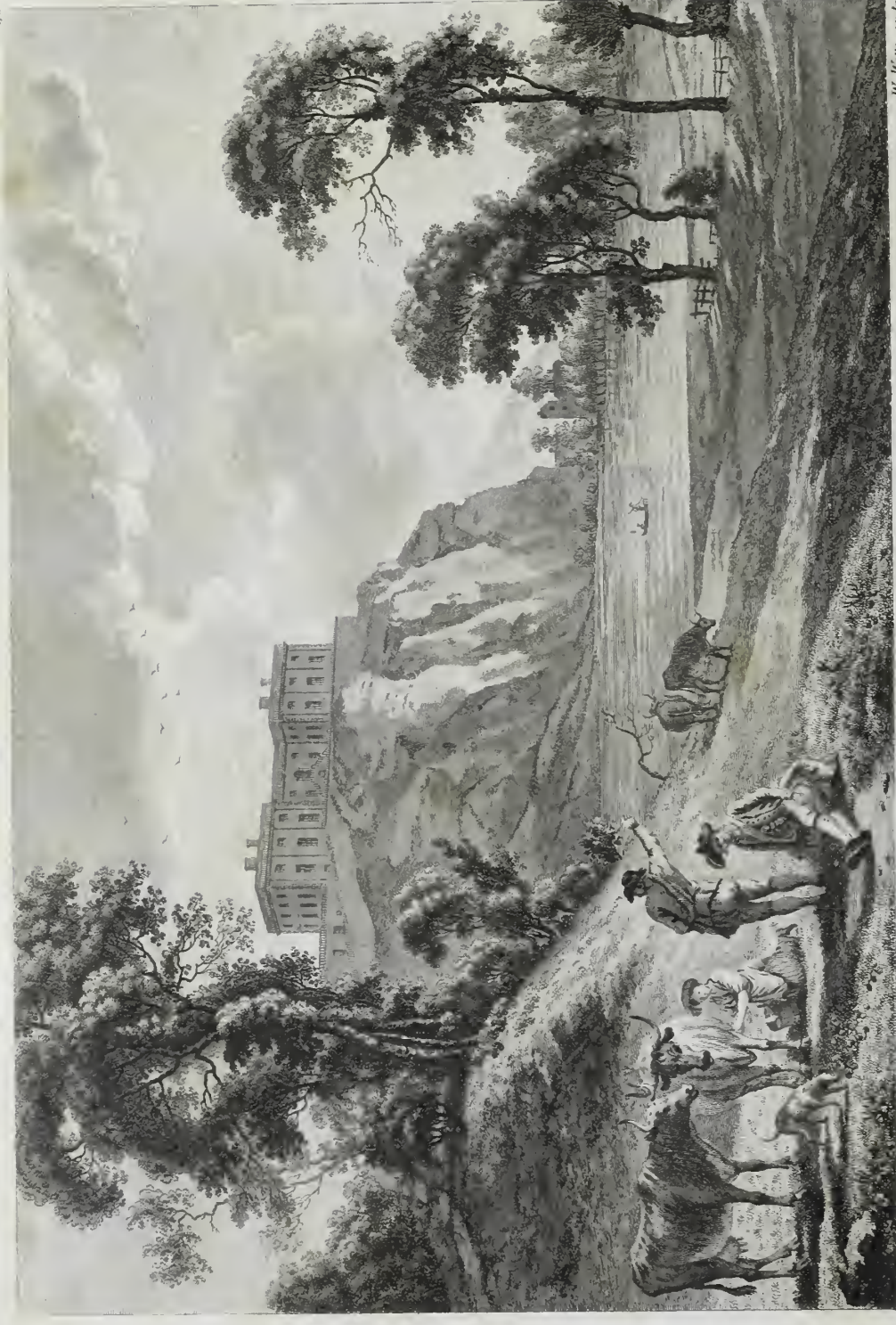
W. Water study