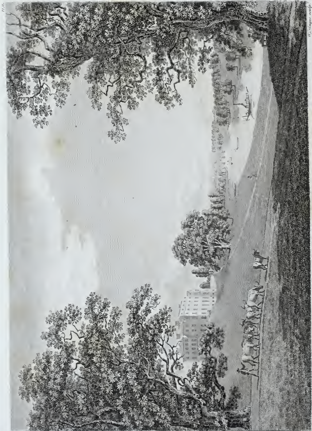
Brocket Hall in Hertfordshire, the Seat of Lord Melbourn.