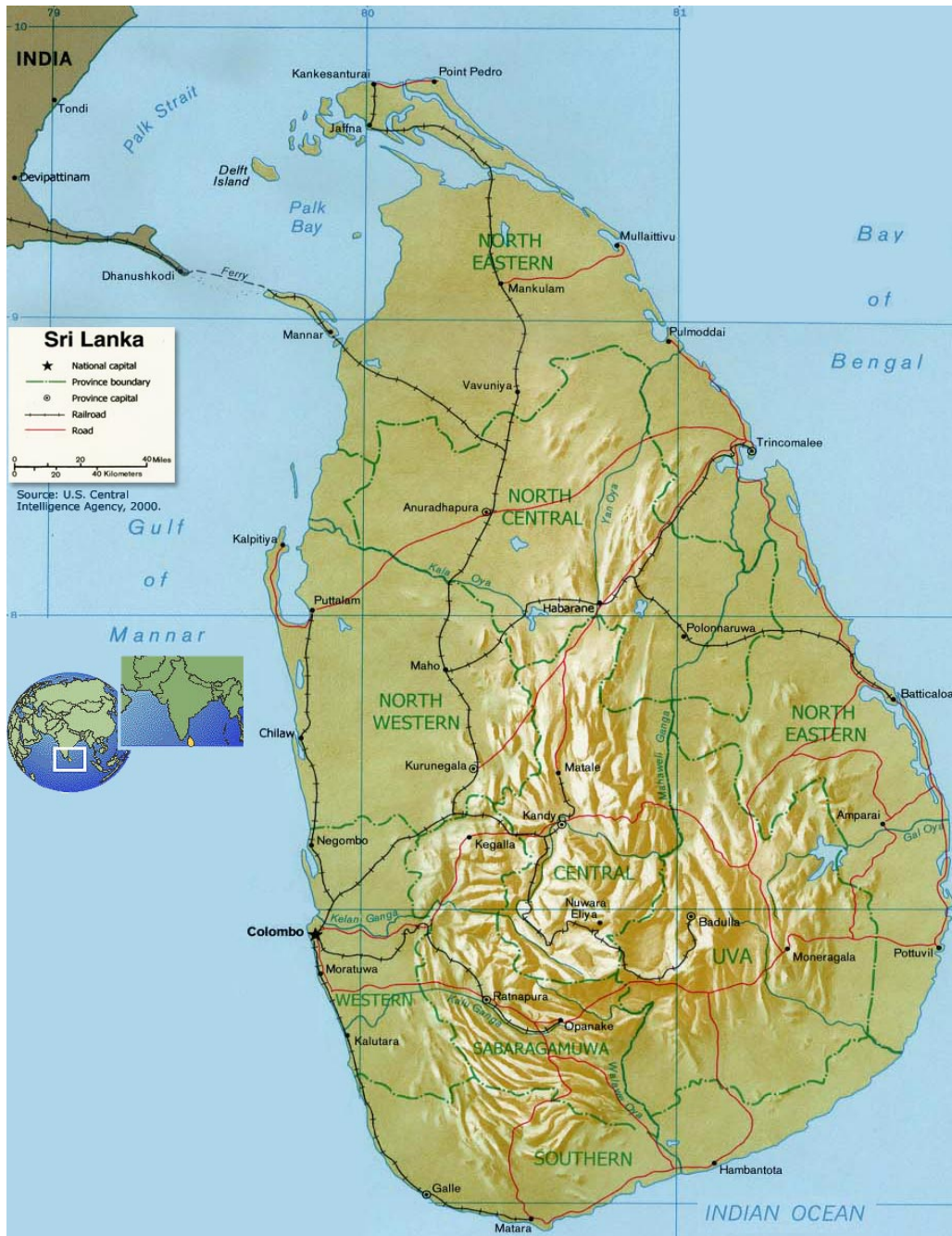
Figure 4. Map of Sri Lanka