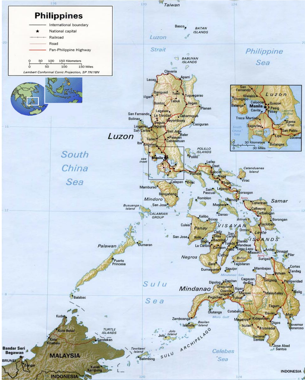
Figure 3. Map of Philippines