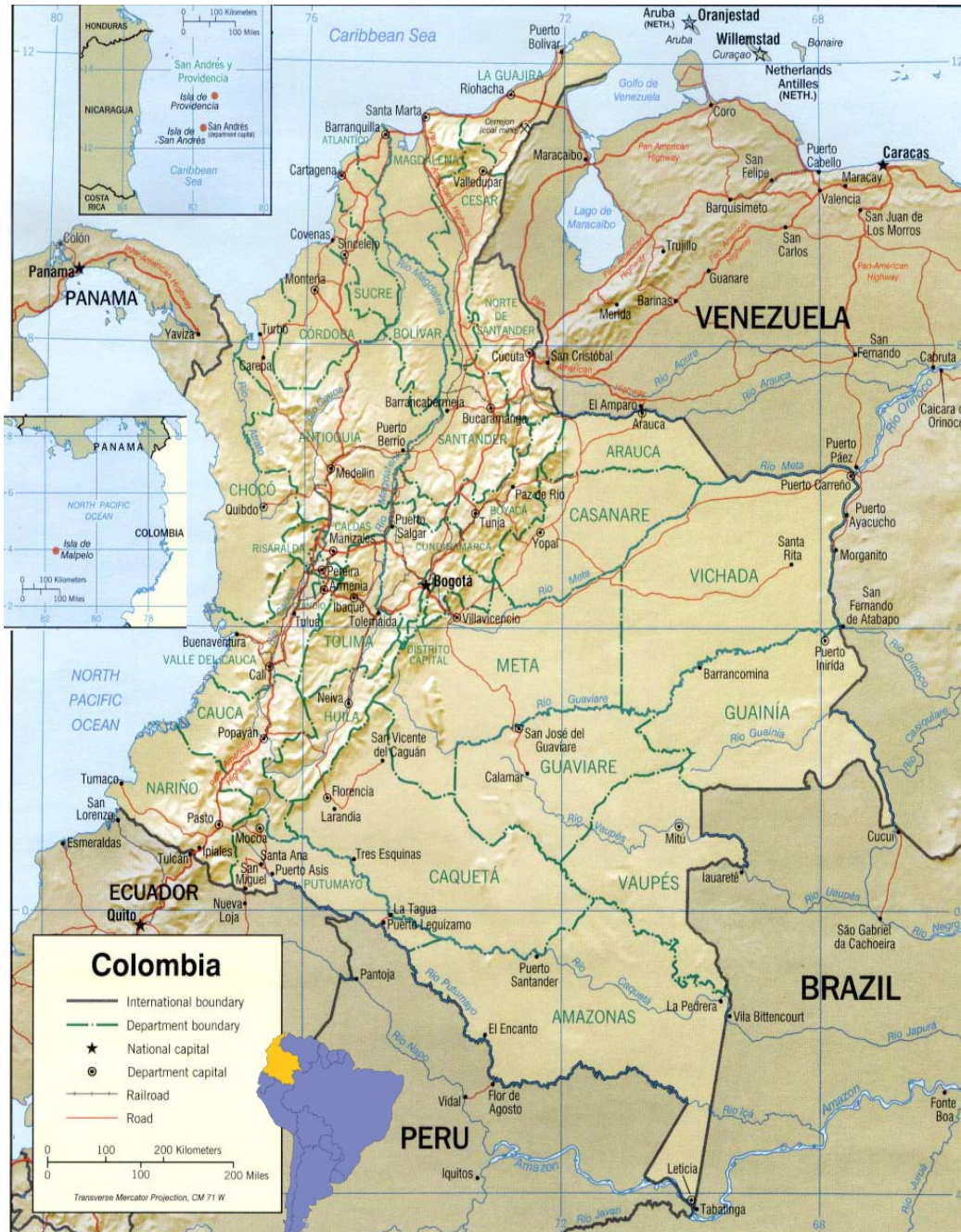
Figure 5. Map of Colombia.