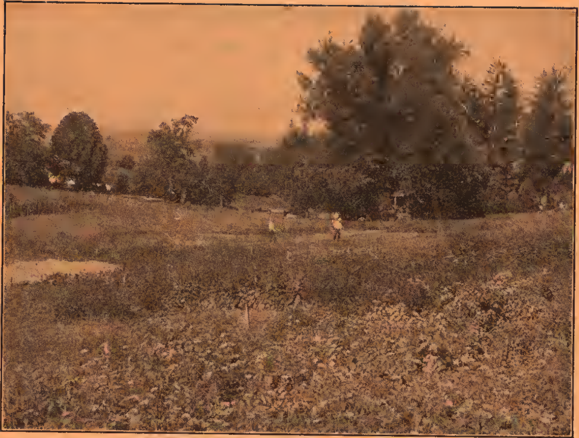
Partial view of Herbaceous Plantations