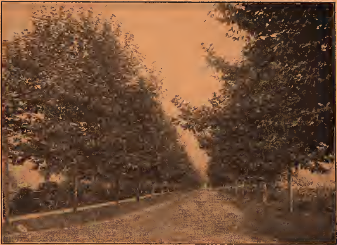
An Avenue of "Andorra-grown" Oriental Planes. (See page 30).