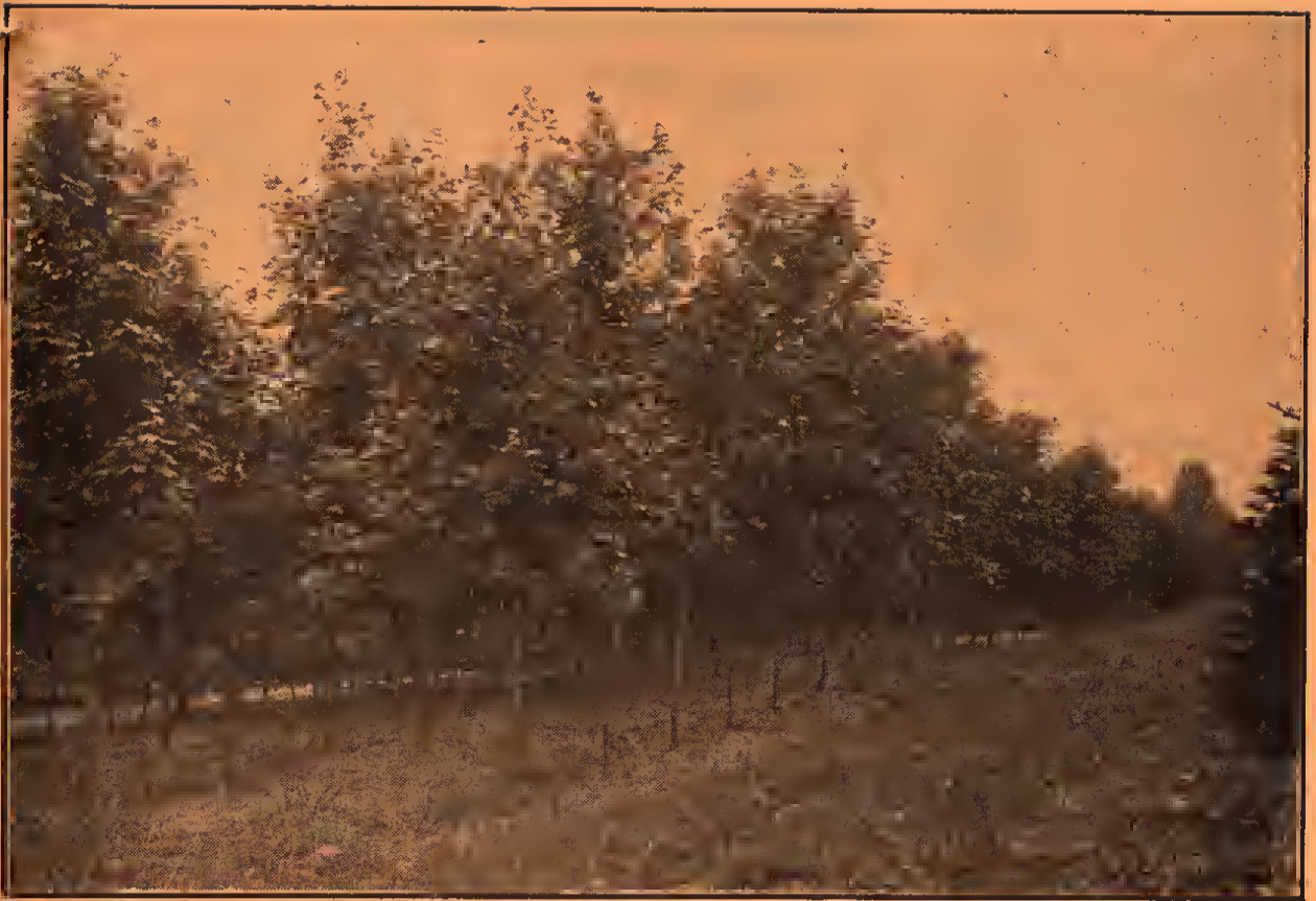
Specimen Norway Maples in Wide Rows.