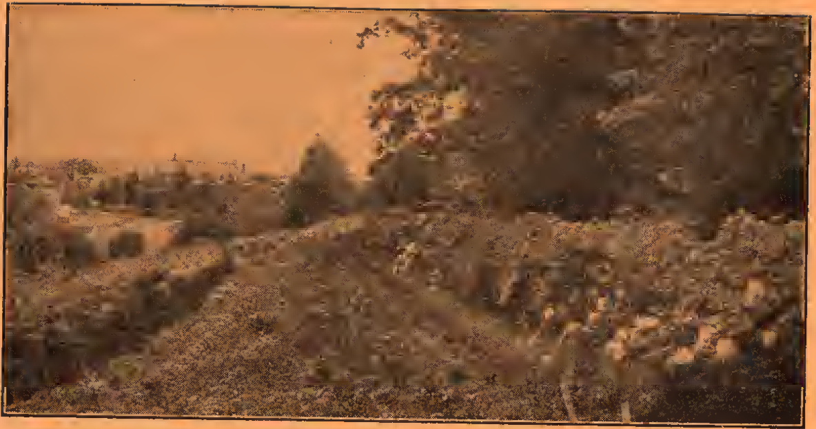
Rhododendrons at Andorra.