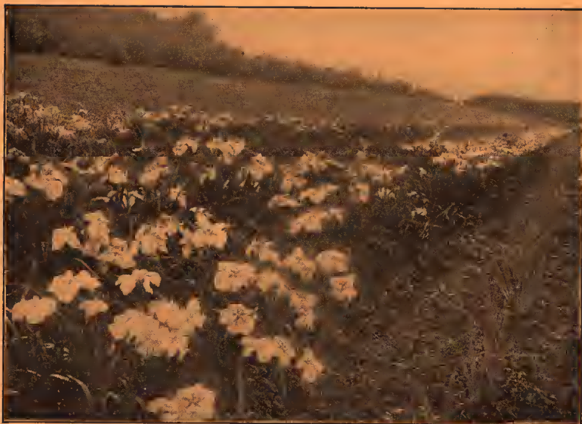
A field of Japanese Iris at Andorra