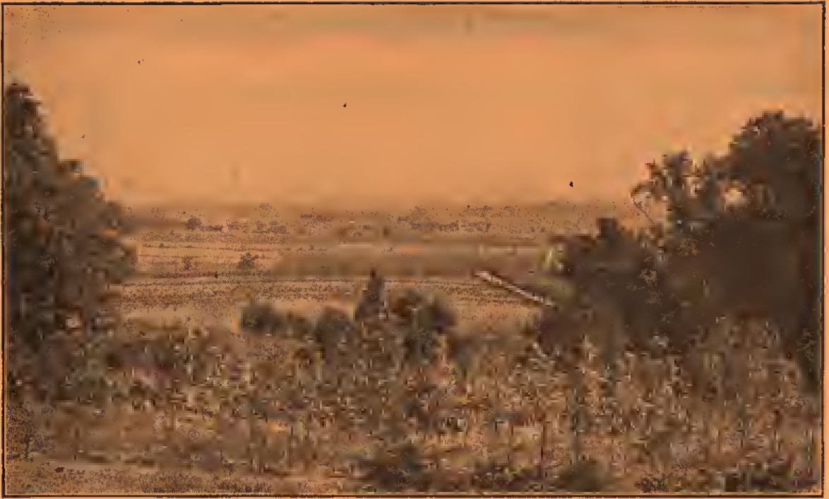
Partial View of Nursery Grounds from Top of Main Nursery.