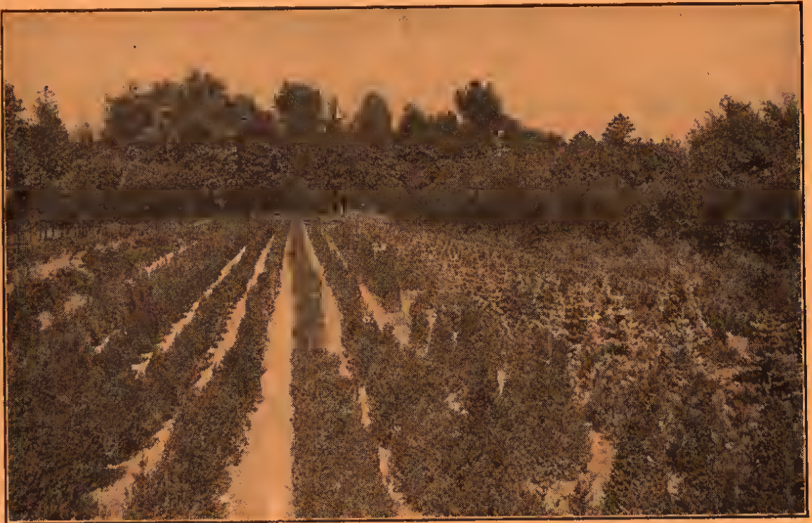
A Block of Box Bush and Evergreens.