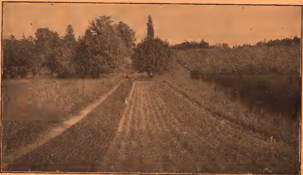
A Portion of the Propagating Grounds at Andorra.