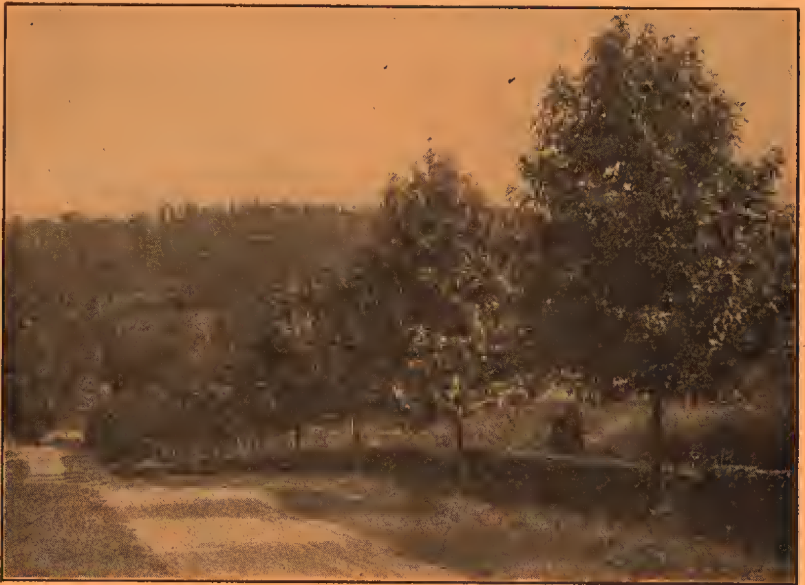
An Avenue of Sweet Gums (Liquidambar), at Andorra.