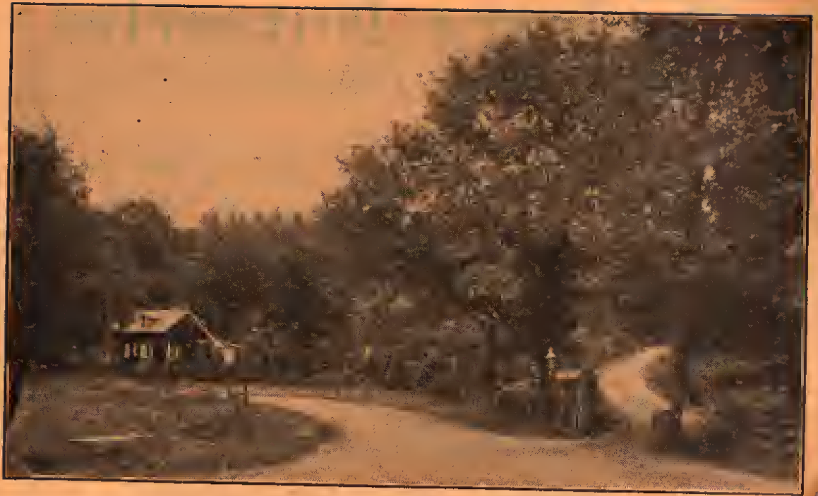
Nursery Entrance and Office.