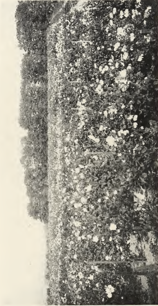
Showing a Portion of our Fields in Bloom

This garden spot of marvelous beauty, only thirty-five miles from New York city, may be reached by a pleasant drive along the north shore of Long Island. It is accessible to thousands who visit and enjoy it.