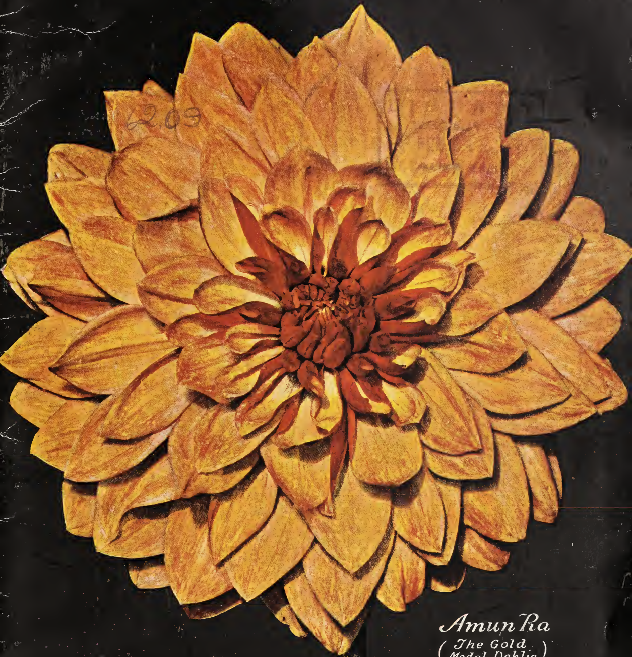
Amun Ra (The Gold Medal Dahlia)