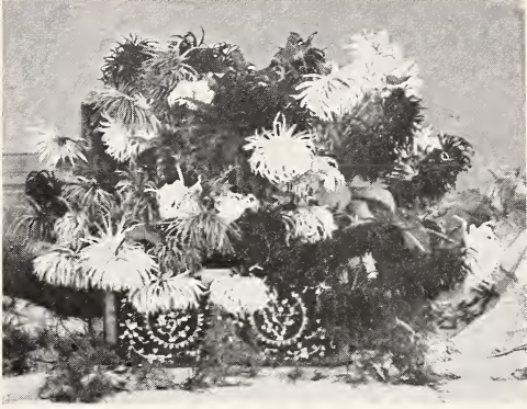
Chest of Cactus Dahlias.

Alabaster —The finest white Cactus. Large and incurved. An indispensable exhibition variety, beautiful for garden, and a fine cut flower. $1.00.