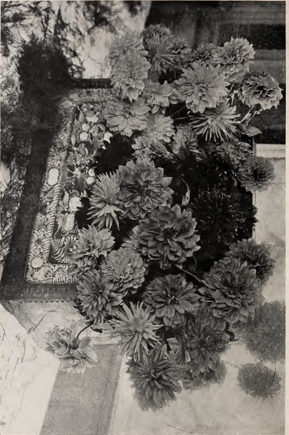
Antique Chinese Chest of Dahlias in our Exhibit at the Palace Hotel. The seven large Dahlias on the right are AMUN RA. (See description Page 4)