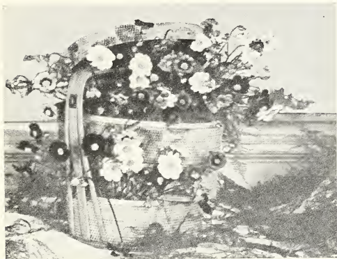
Basket of European Single Dahlias.

These miniature Dahlias are indescribably beautiful, and have remarkable color combinations. Our basket of these delightful Single Dahlias were greatly admired at the recent Palace Hotel Show.