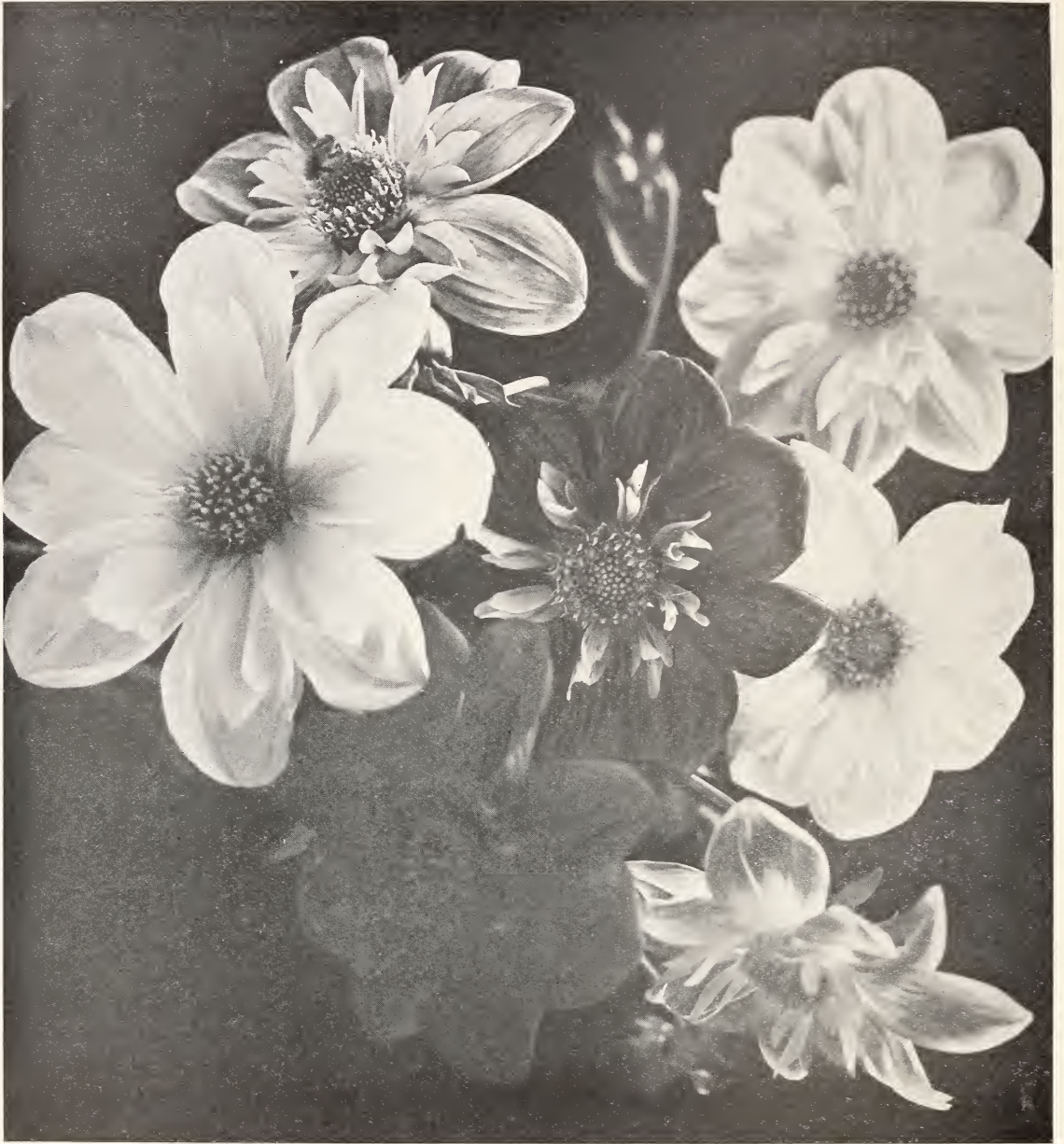
Collarette Dahlias. For description see page 19.