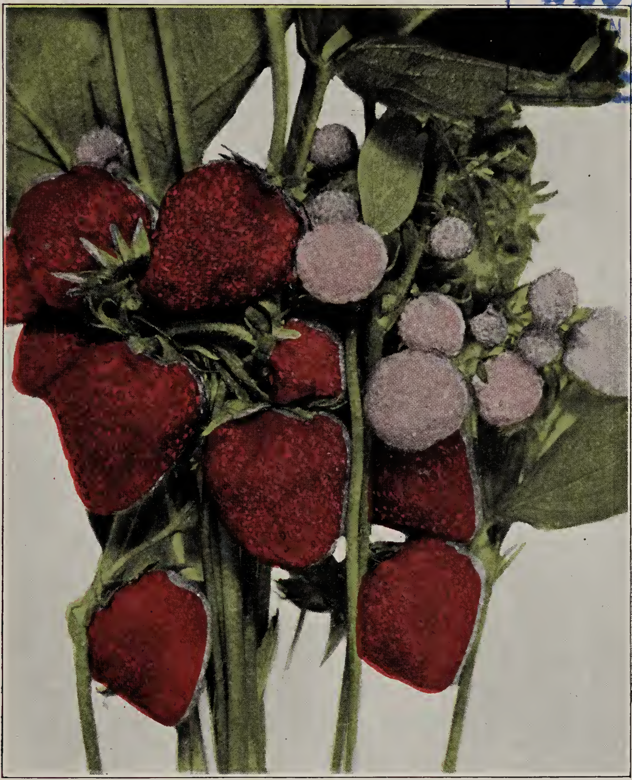
PREMIER—The Most Profitable Strawberry

LIBRARY RECEIVED MAY 11 1934 ★ Dept. of Agriculture.