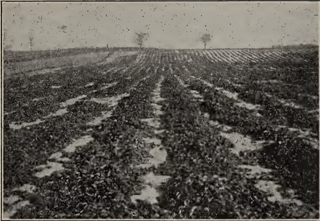
A Field of Our Premier Plants