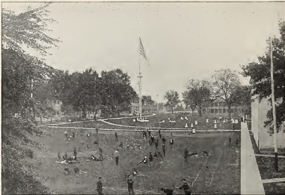
VIEW OF THE CAMPUS.

One feature of the School is the beauty of the grounds and their special adaptability to the purposes of a school. During the recreation periods the students spend many happy hours on the campus in playing croquet, tennis, ball and other games, or in quietly promenading, reading and chatting.