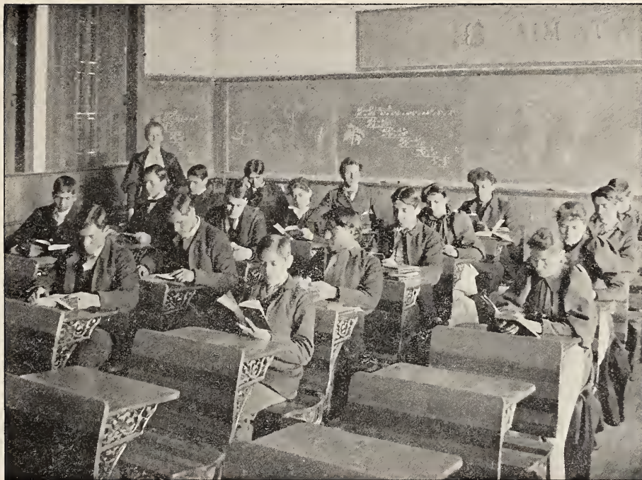
A SCHOOL ROOM INTERIOR.

This picture gives a partial view of school room No. 12, occupied by the Senior Class. The school rooms are 28 x 30 x 13 feet, well lighted and ventilated, fitted with single desks and slate blackboards, and aggregate accommodations for 700 pupils.