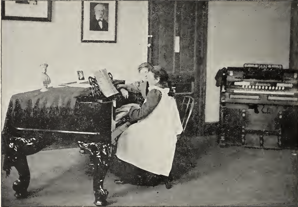
A MUSIC ROOM.

Very early in the School experience it was found that there were good voices among the pupils and ability to acquire both vocal and instrumental knowledge. Music proves a pleasing study to the Indian youth, and is useful and entertaining to the School.