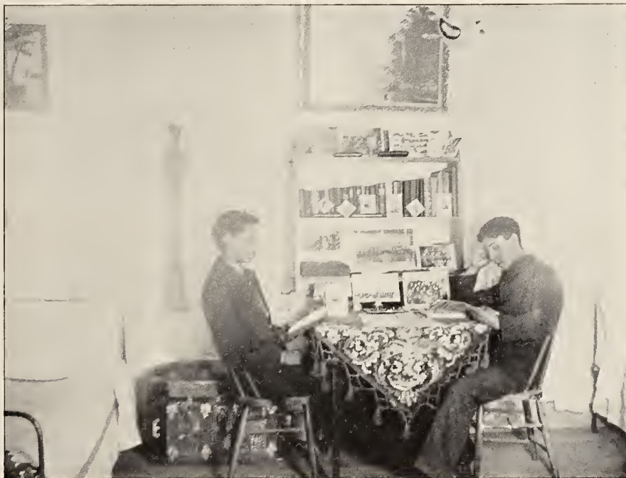
BEDROOM—LARGE BOYS' QUARTERS.

These rooms, 14 x 16 feet, contain three beds each, a wardrobe with three divisions, one for each occupant, a table, chair, washstand, etc., and are decorated with such pictures and ornaments as the occupants may be able or choose to provide.