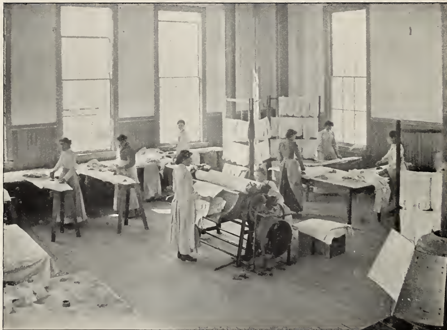
THE IRONING ROOM.

The Laundry is provided with three steam washers, stationary tubs, a centrifugal wringer, a mangle, and a steam drying room.