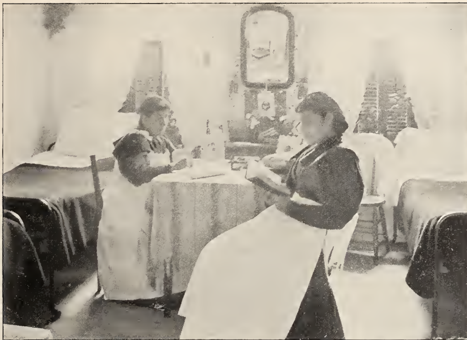
INTERIOR OF GIRLS' ROOM.

The sleeping rooms in the Girls' Quarters are about 14 x 16 feet, each occupied by three girls, and in order to forward the use of English these girls usually represent three different tribes. The rooms are furnished with wardrobes, single beds, bureau, washstand, table, chairs and such decorations as the girls arrange.