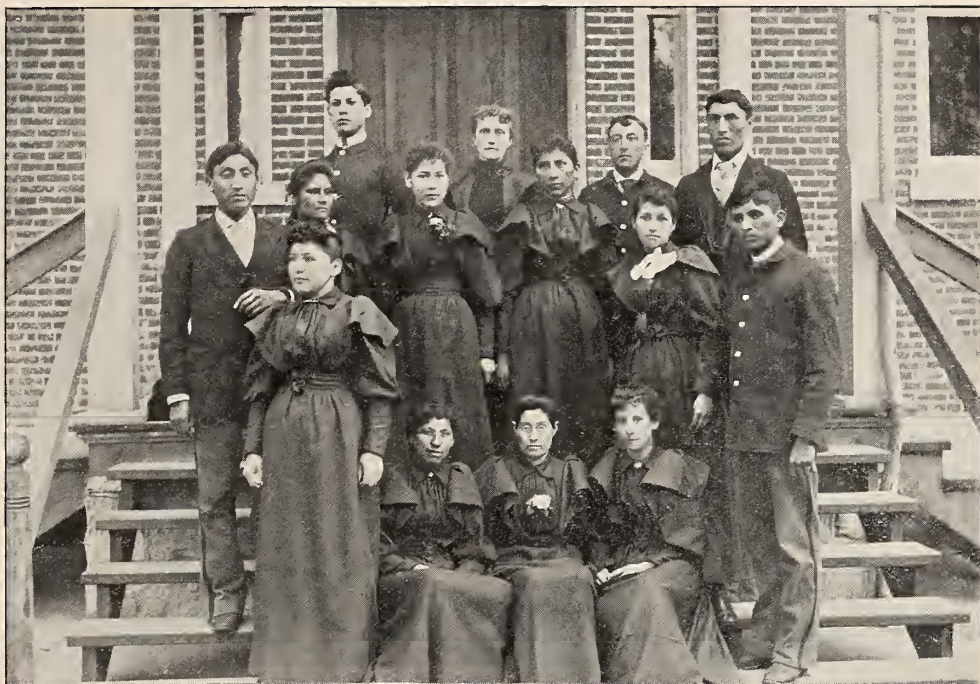
THE PUPIL TEACHERS.

One of the most helpful features of the School is the normal training given students who show ability, and desire to qualify as teachers. This department becomes more and more important each year as the students thus trained increase in number and go out to fill positions in other schools.