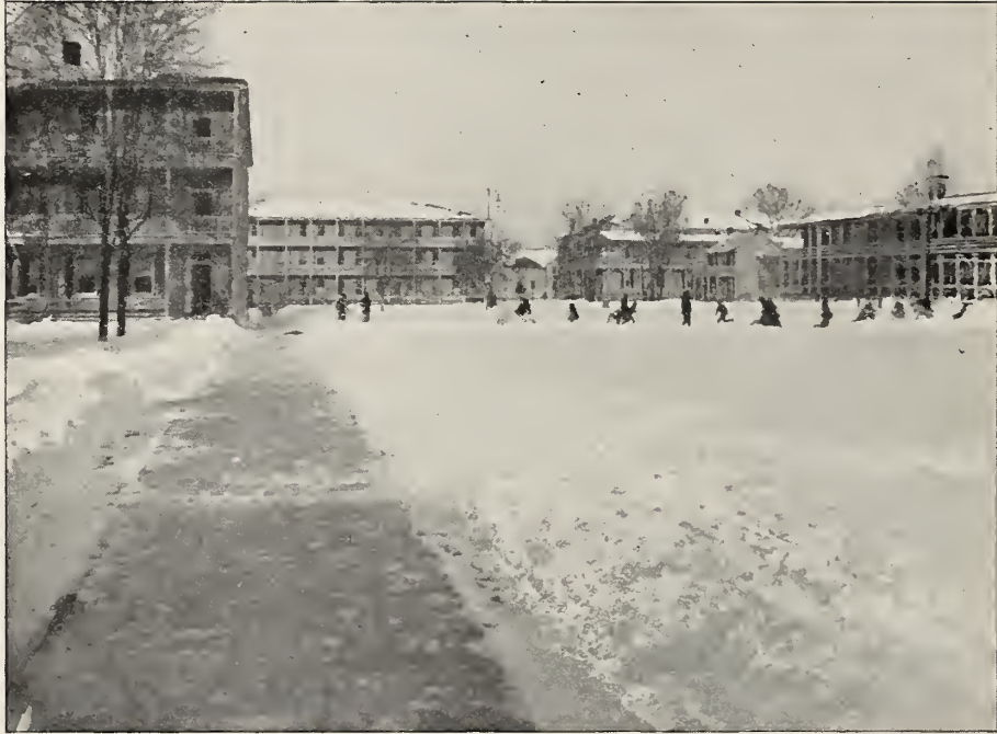
THE CAMPUS IN WINTER.