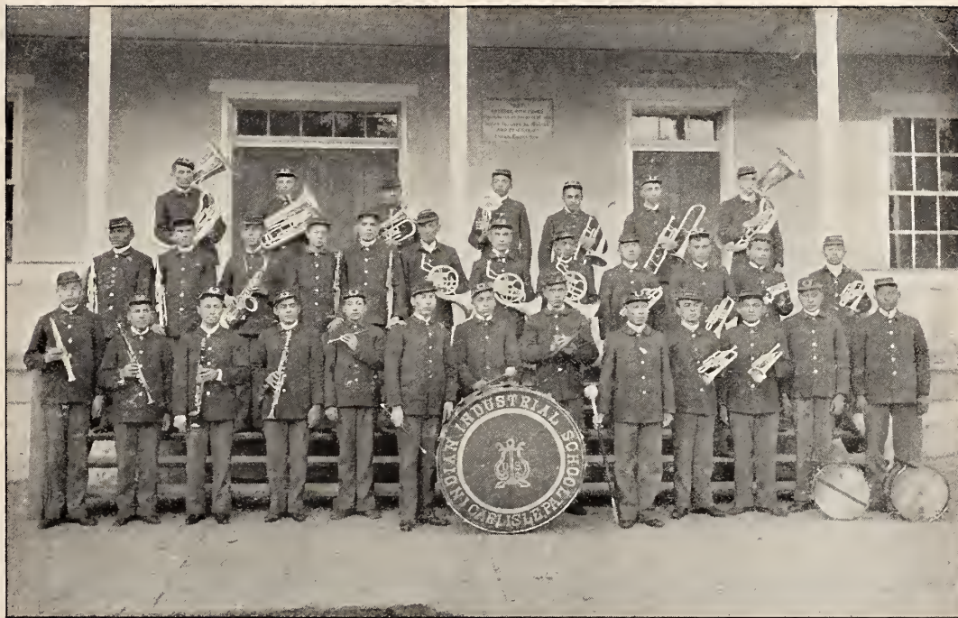
THE SCHOOL BAND.

In 1880 a benevolent lady of Boston presented the school with a set of band instruments. Under its present leader, a graduate of the School, it has a recognized place among the good bands of the country, and has performed acceptably before critical audiences in our large cities, notably at the parades in New York and Chicago during the Columbian Quadra-Centennial.