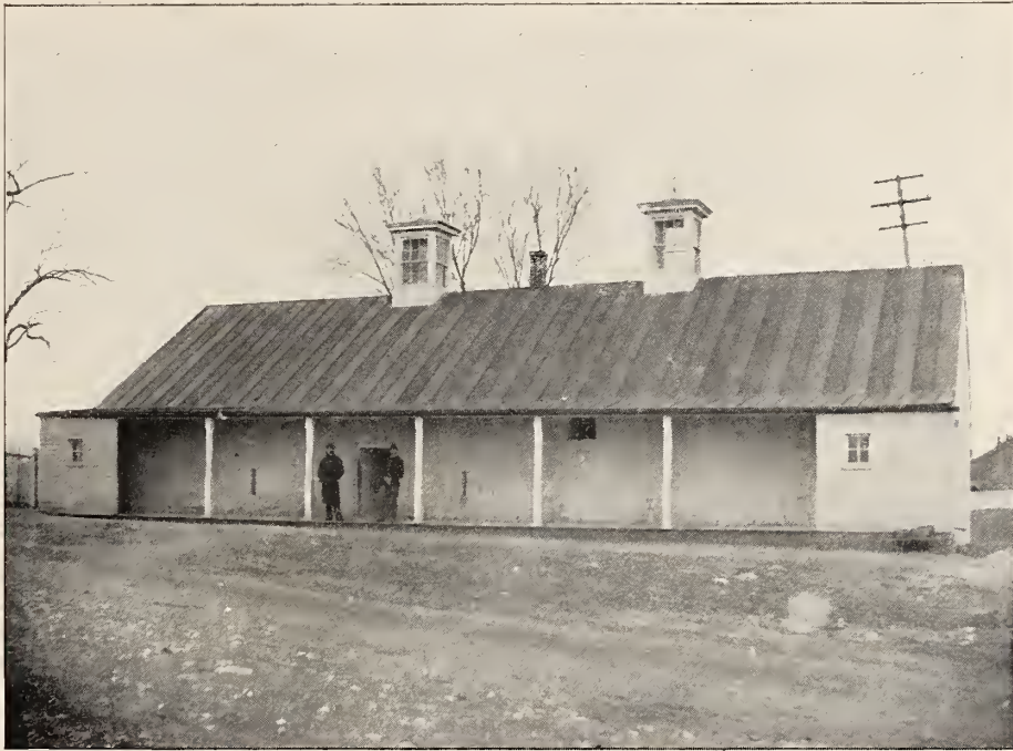
THE GUARD HOUSE.

At the entrance gate stands the old Guard House, which is one of the historic buildings of Pennsylvania. It was built by the Hessian soldiers whom Washington captured at the battle of Trenton, in 1776, and sent to this place as prisoners of war. The School follows a system of military guard duty, and the Guard House is used as the headquarters for the sentinels.