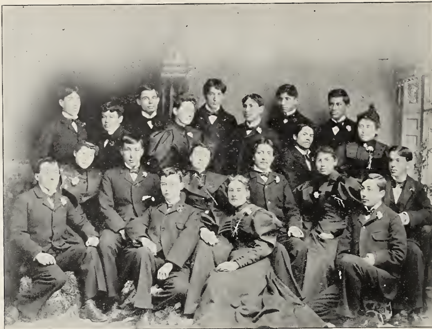
THE SEVENTH CLASS OF GRADUATES. 1895.