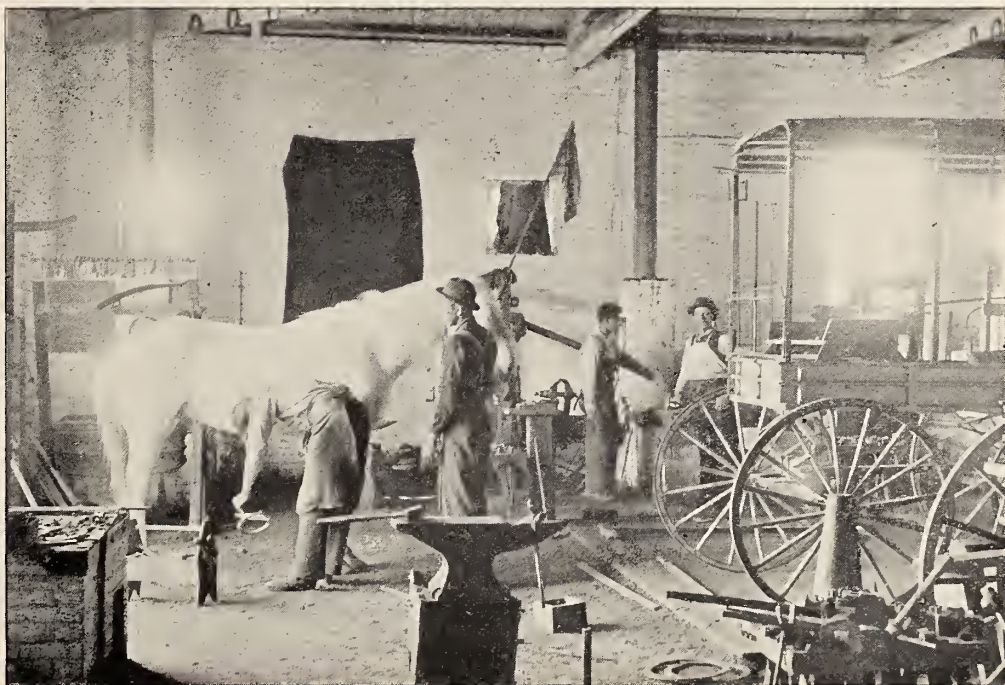
THE BLACKSMITH SHOP.

The Indian boys soon become adepts in this trade, forging the horseshoe and setting it, learning to fashion the iron to any desired shape, working bar steel into tools with skill and readiness hardly credible unless witnessed.