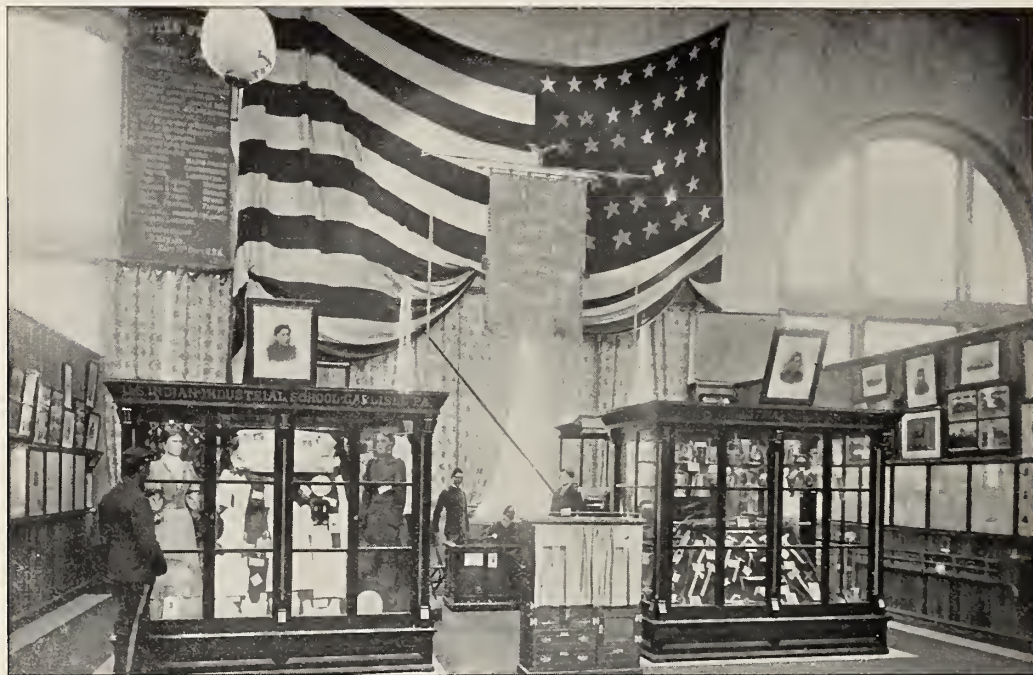
THE WORLD'S FAIR EXHIBIT. I

The exhibit of Carlisle School at the World's Fair compared favorably with the exhibits from other industrial schools of the country, and won for Carlisle diplomas from the Department of Liberal Arts and the Department of Agriculture. The School has also been awarded medals for exhibits made in Paris and Madrid, and other diplomas on less important occasions.