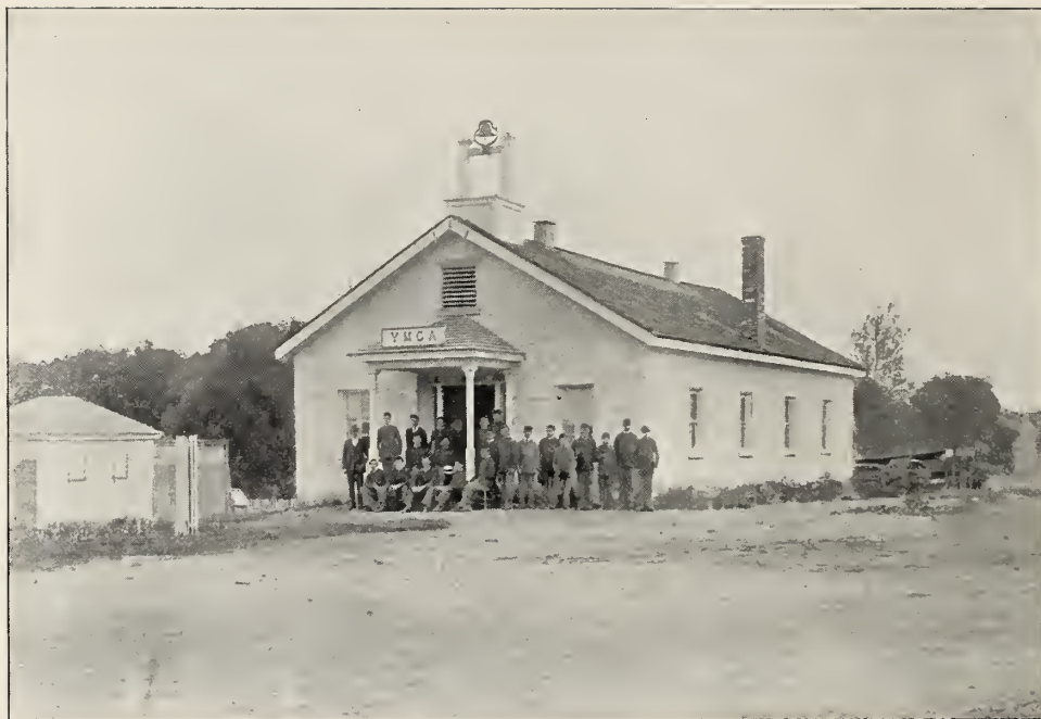
THE Y. M. C. A.

This Association, started in 1884 with a small membership, has now about 150 members, with a neat hall, 54 x 29 feet, comfortably furnished. It is in full membership in the state and national organizations, sending regular delegates and reports to their conventions.