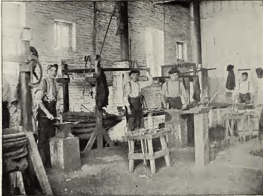
THE BLACKSMITH SHOP INTERIOR