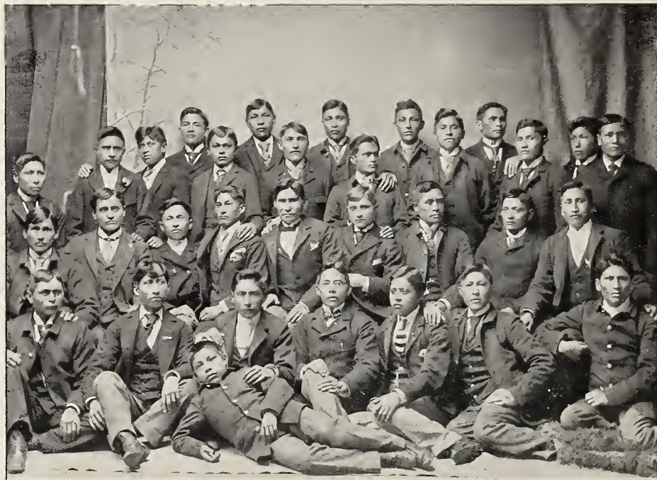
GROUP OF APACHES.

Of all the Indians Carlisle has undertaken, no tribe presented a more hopeless outlook than the Apaches from Arizona, who have long held a most unenviable reputation as the outlaws and the Ishmaelites of the Indians. Carlisle's experience with the Apaches is that they are as susceptible as others of civilization. They are unusually active and valuable as workers.