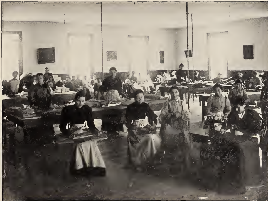
THE SEWING ROOM.

In this department from twenty to sixty girls are daily employed in cutting, making and repairing all the clothing worn by the girls of the School, and the boys' shirts and underclothing.