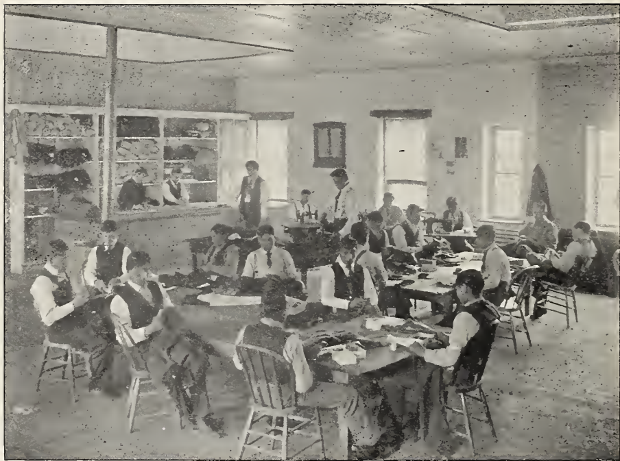
THE TAILOR SHOP.

Here the uniforms and outer garments for 450 boys are made annually.