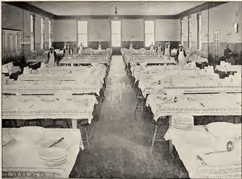
DINING HALL—INTERIOR. This room will seat 700 persons.