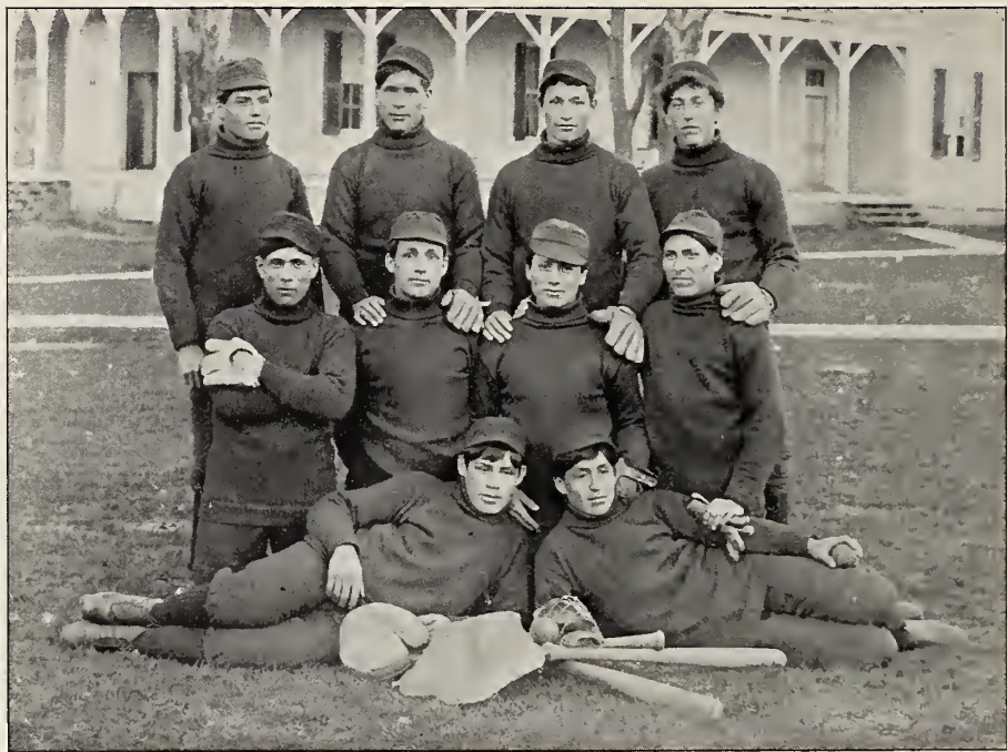
THE BASE BALL TEAM.

The School nine is not always beaten when it comes to a contest with college and other organizations following base ball as a profession.