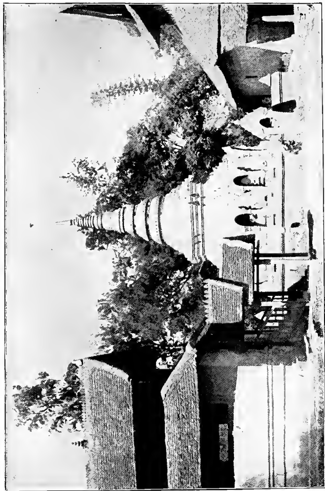
MONASTERY GROUNDS AT CHIENG TUNG, LAOS.