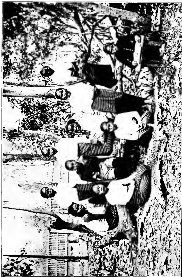
A GROUP OF LAOS GIRLS.