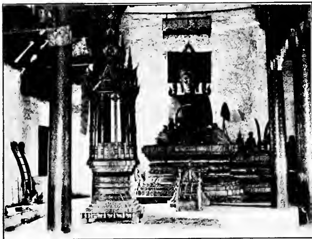
THE INTERIOR OF A BUDDHIST TEMPLE.