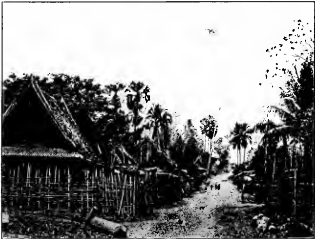
A STREET IN A LAOS TOWN.