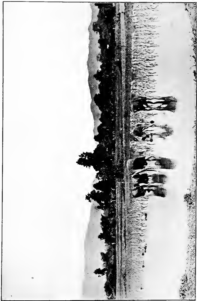
AT WORK IN THE RICE FIELDS.