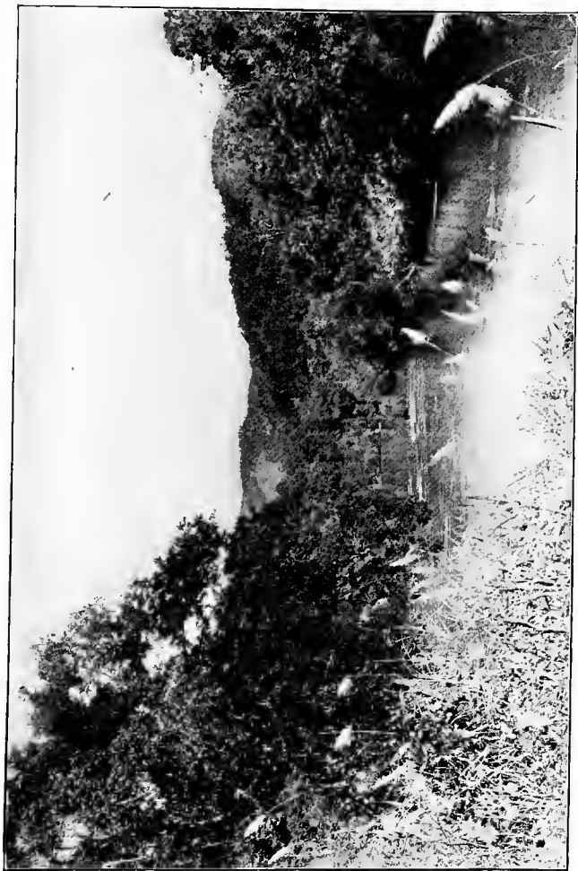
A LAOS FOREST-STREAM.