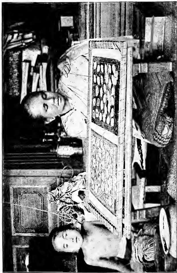
THE LAOS GOVERNOR'S WIFE AT HER EMBROIDERY FRAME.