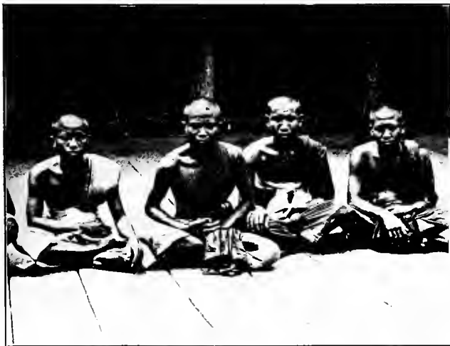
A GROUP OF BUDDHIST PRIESTS.